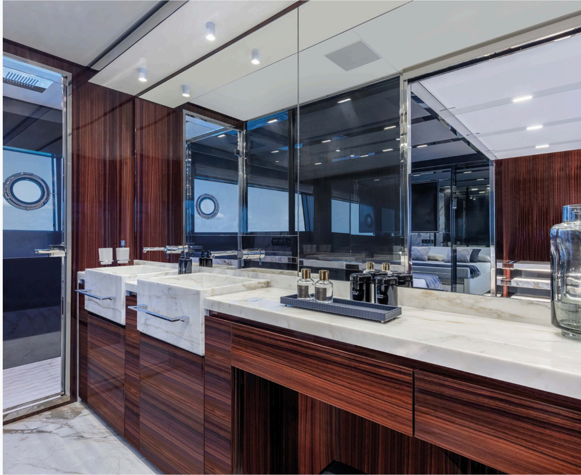
VIP EN-SUITE BATHROOM