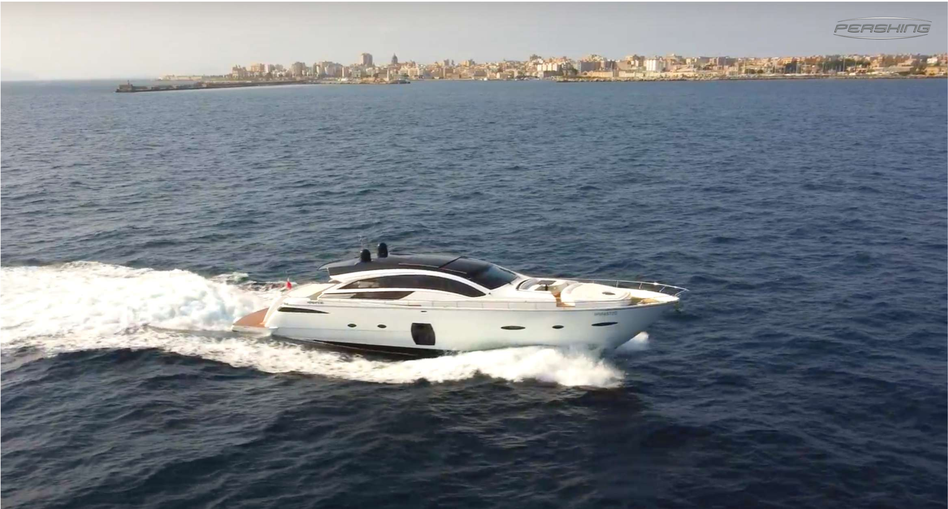
THYKE II PERSHING 80