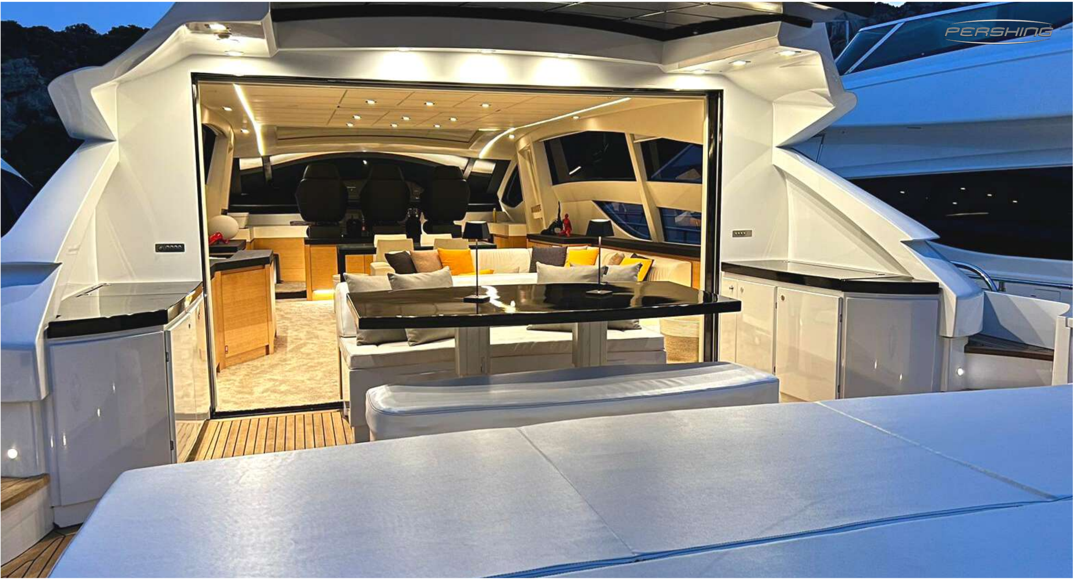
THYKE II PERSHING 80