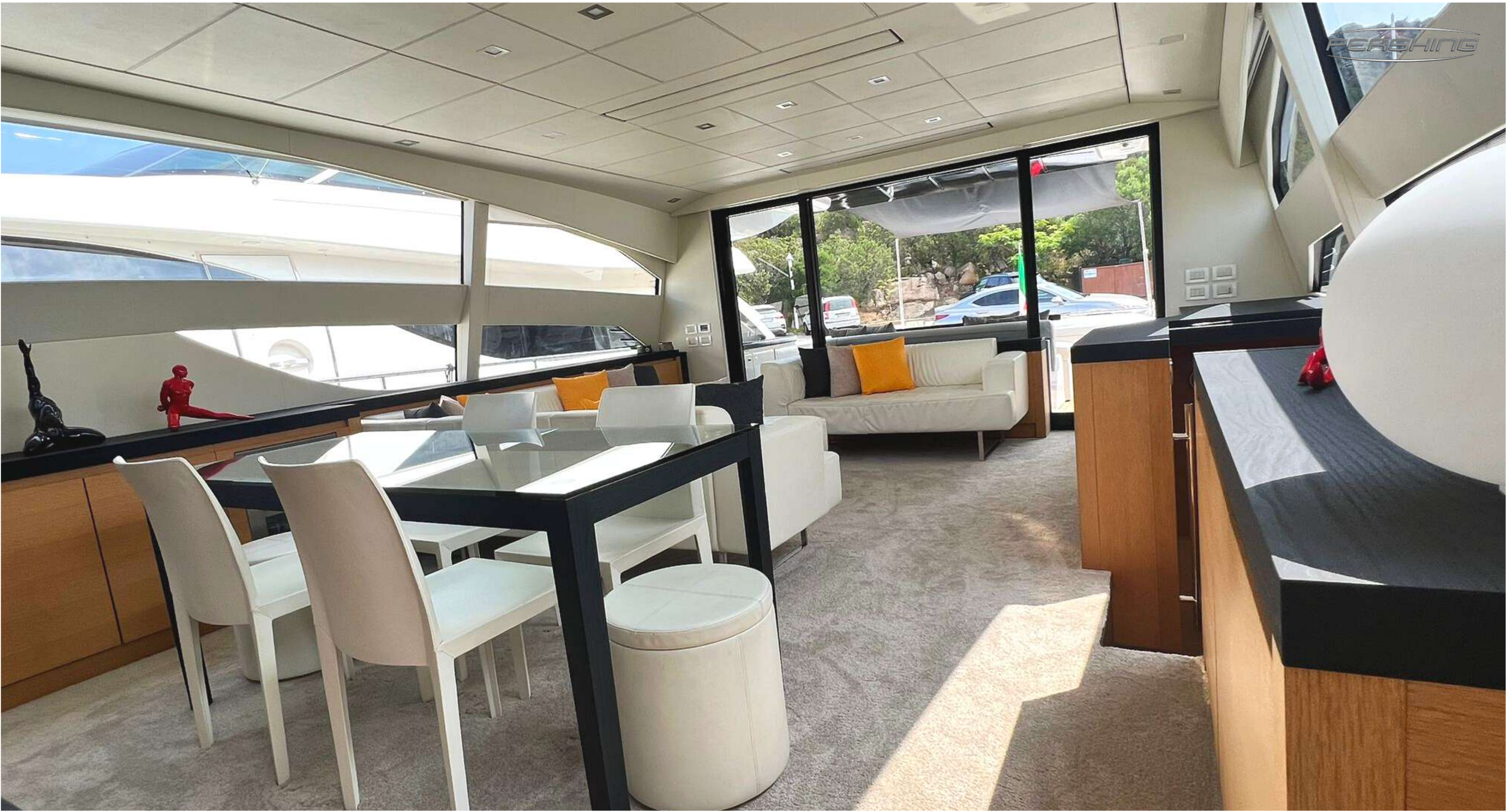
THYKE II PERSHING 80