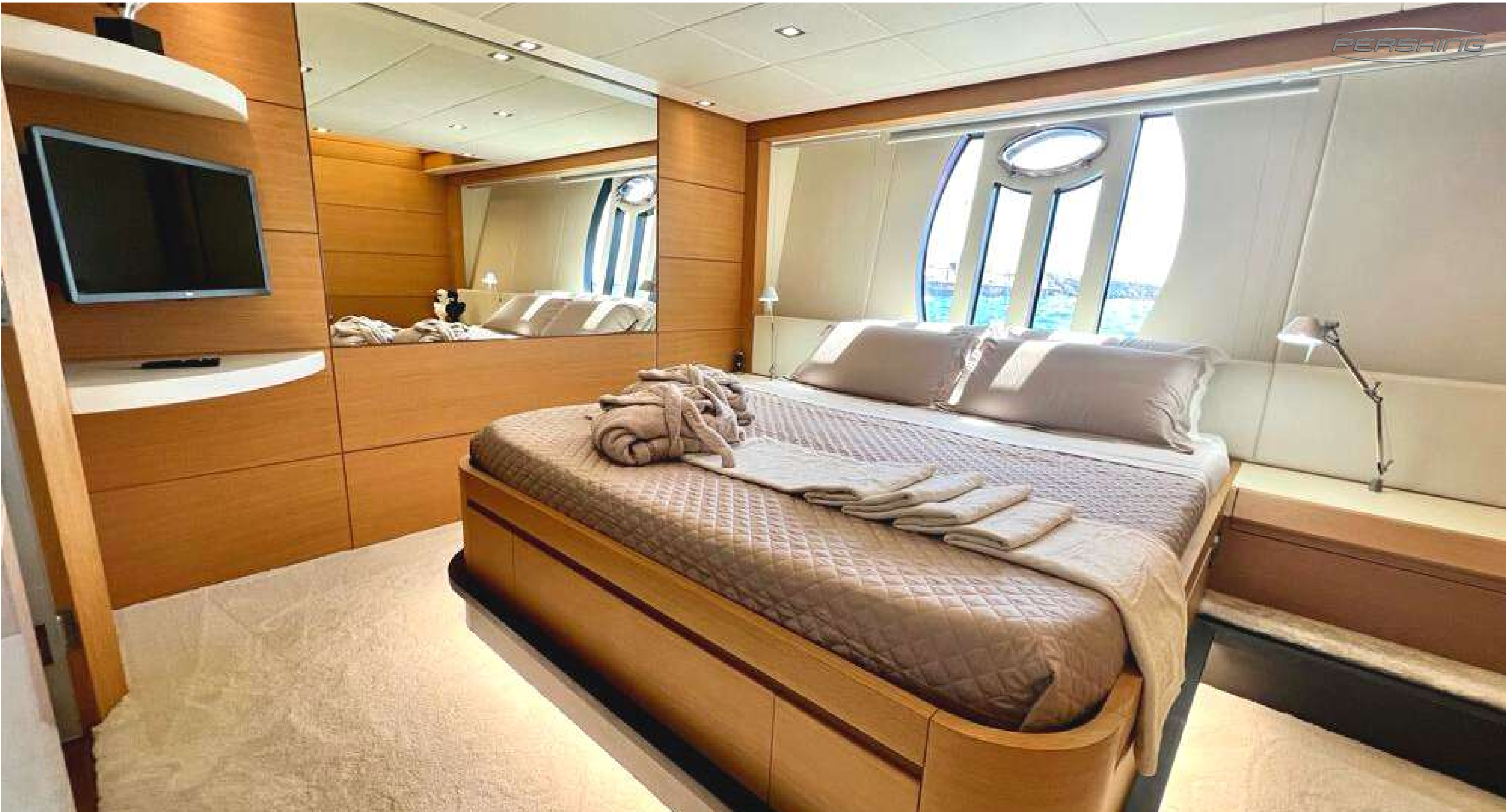
THYKE II PERSHING 80