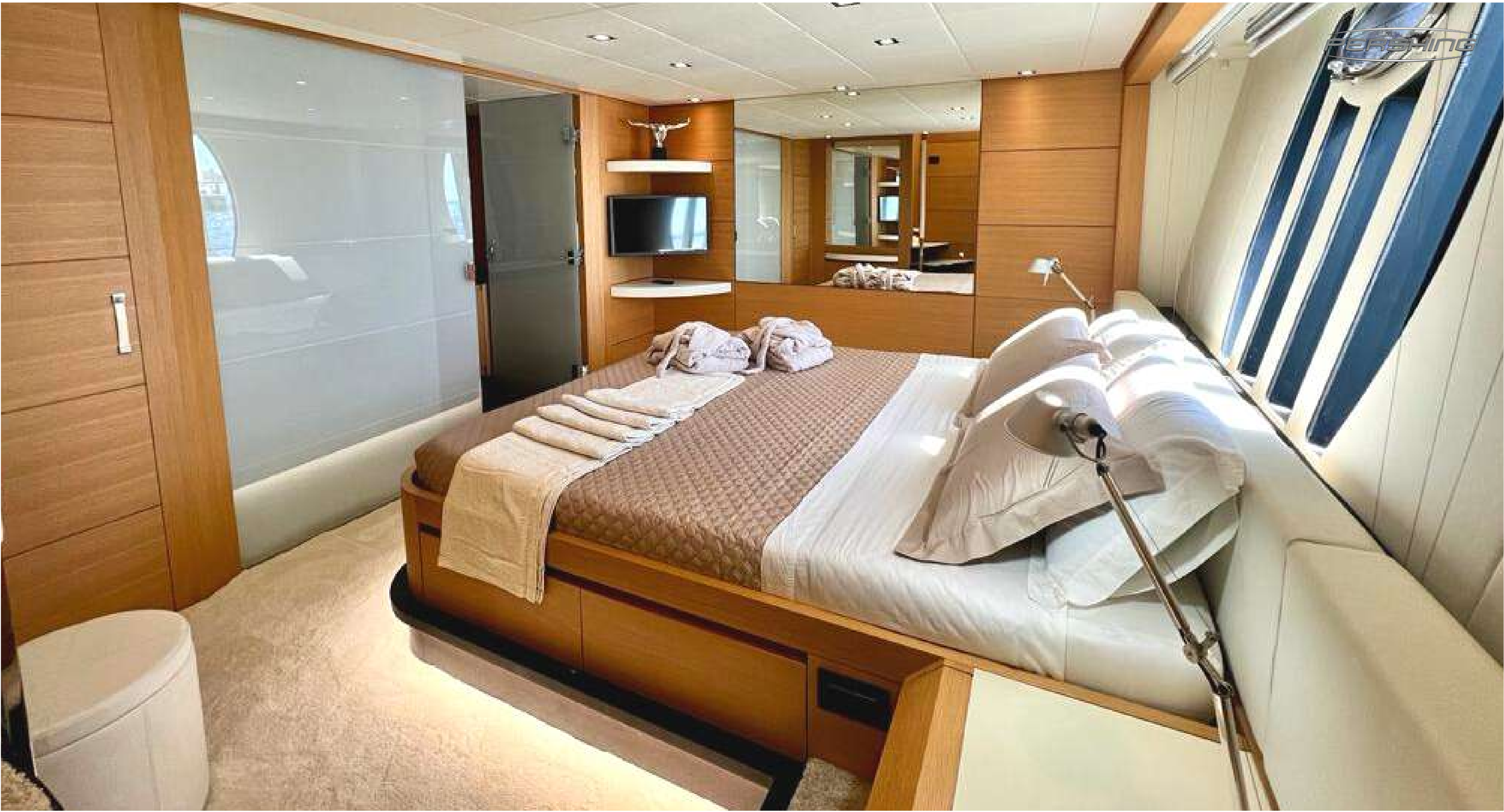
THYKE II PERSHING 80