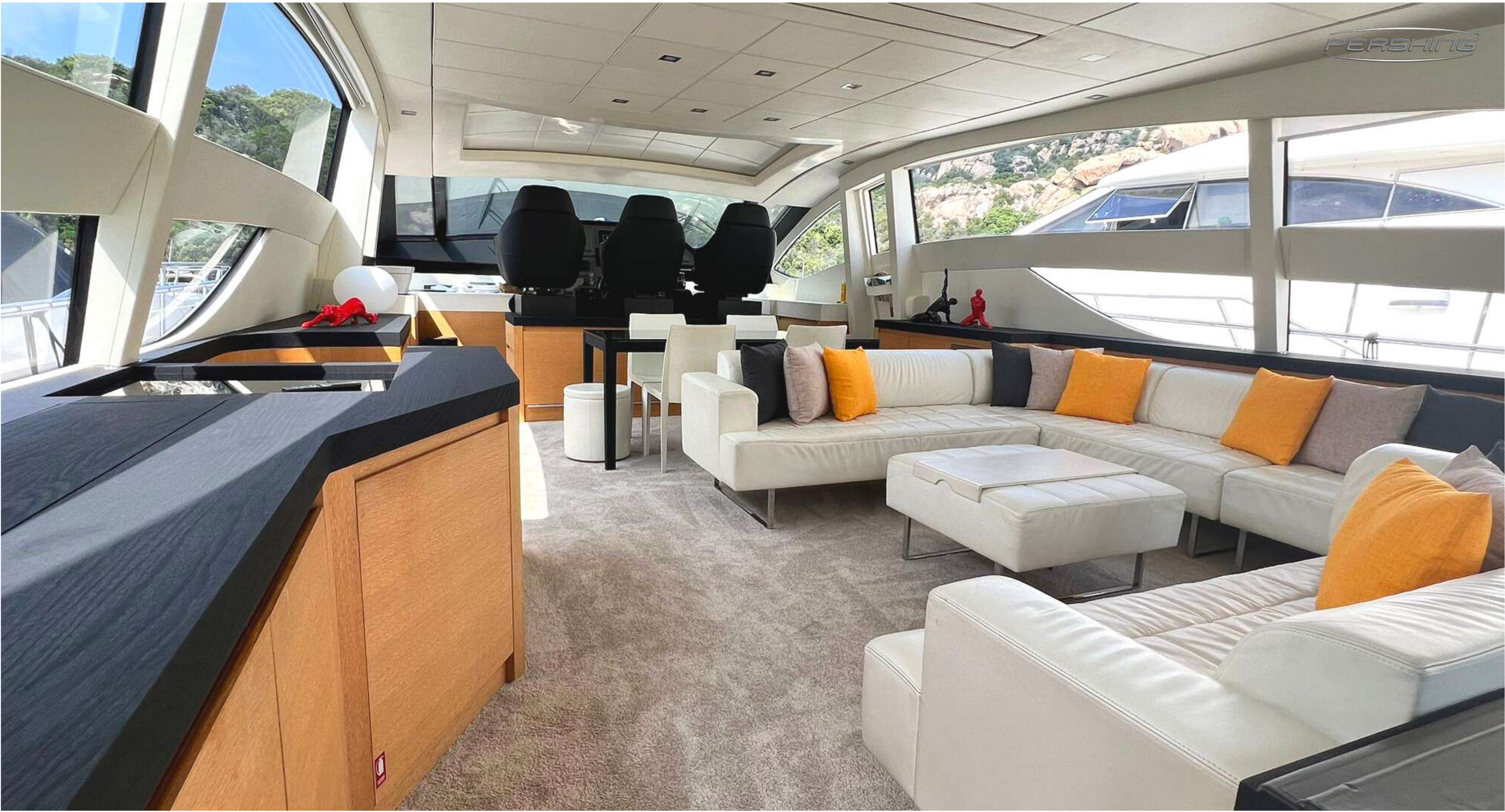
THYKE II PERSHING 80