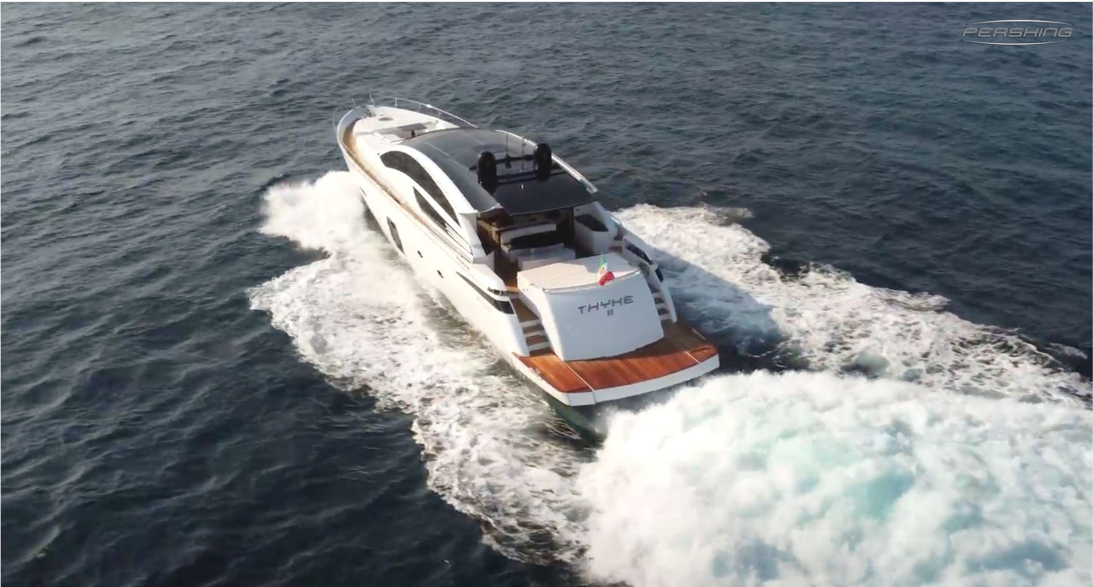
THYKE II PERSHING 80