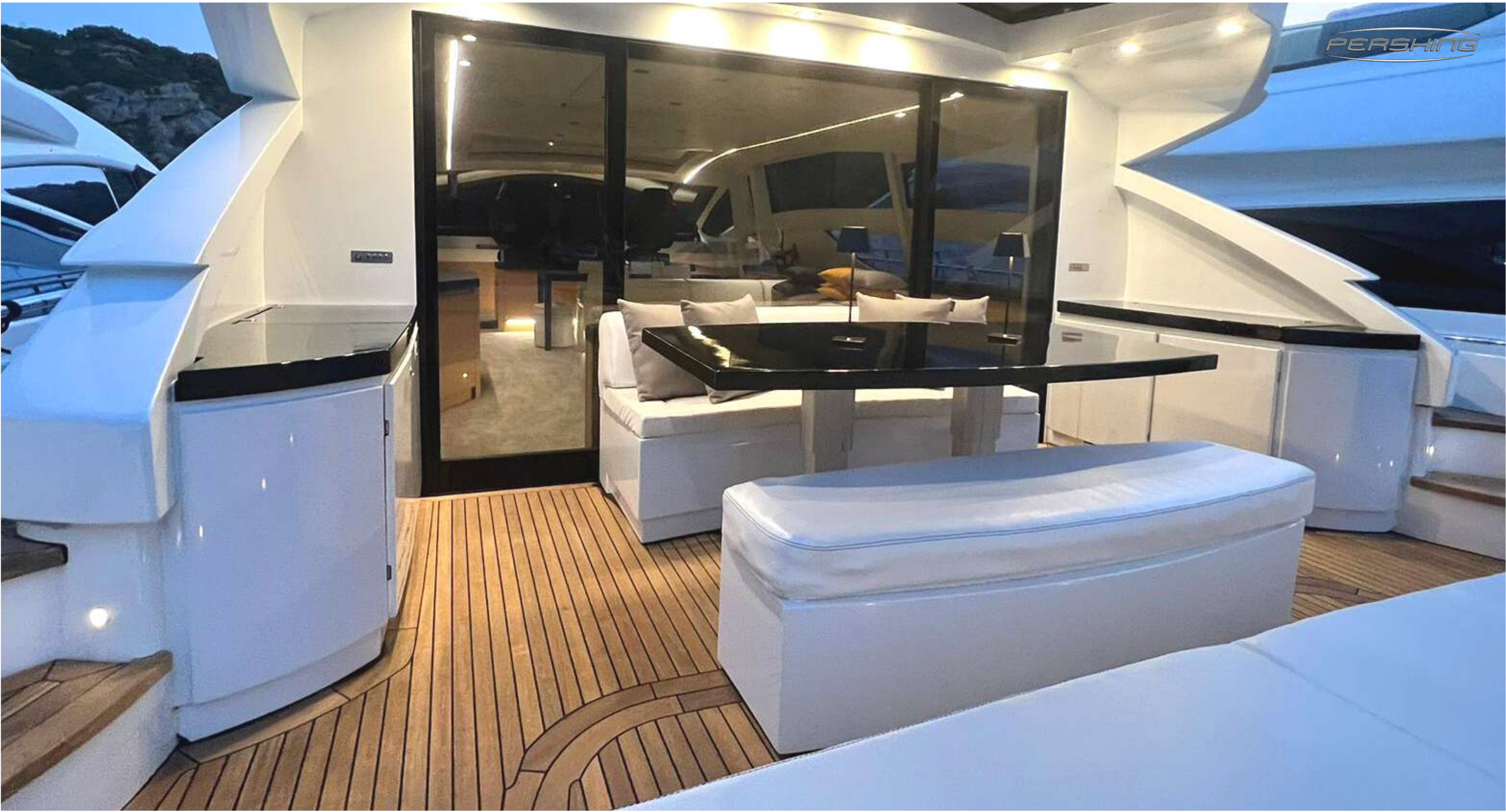
THYKE II PERSHING 80