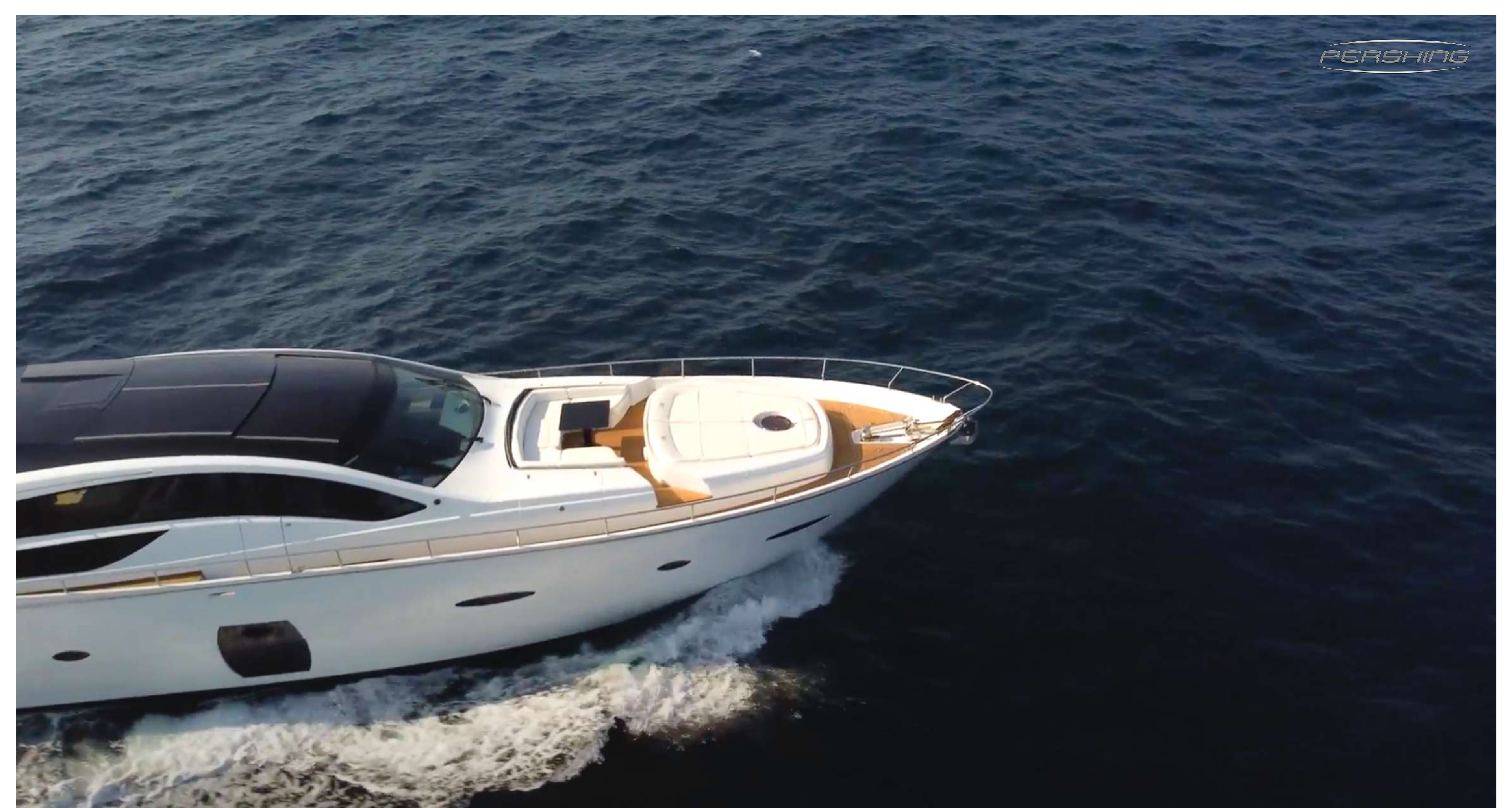
THYKE II PERSHING 80