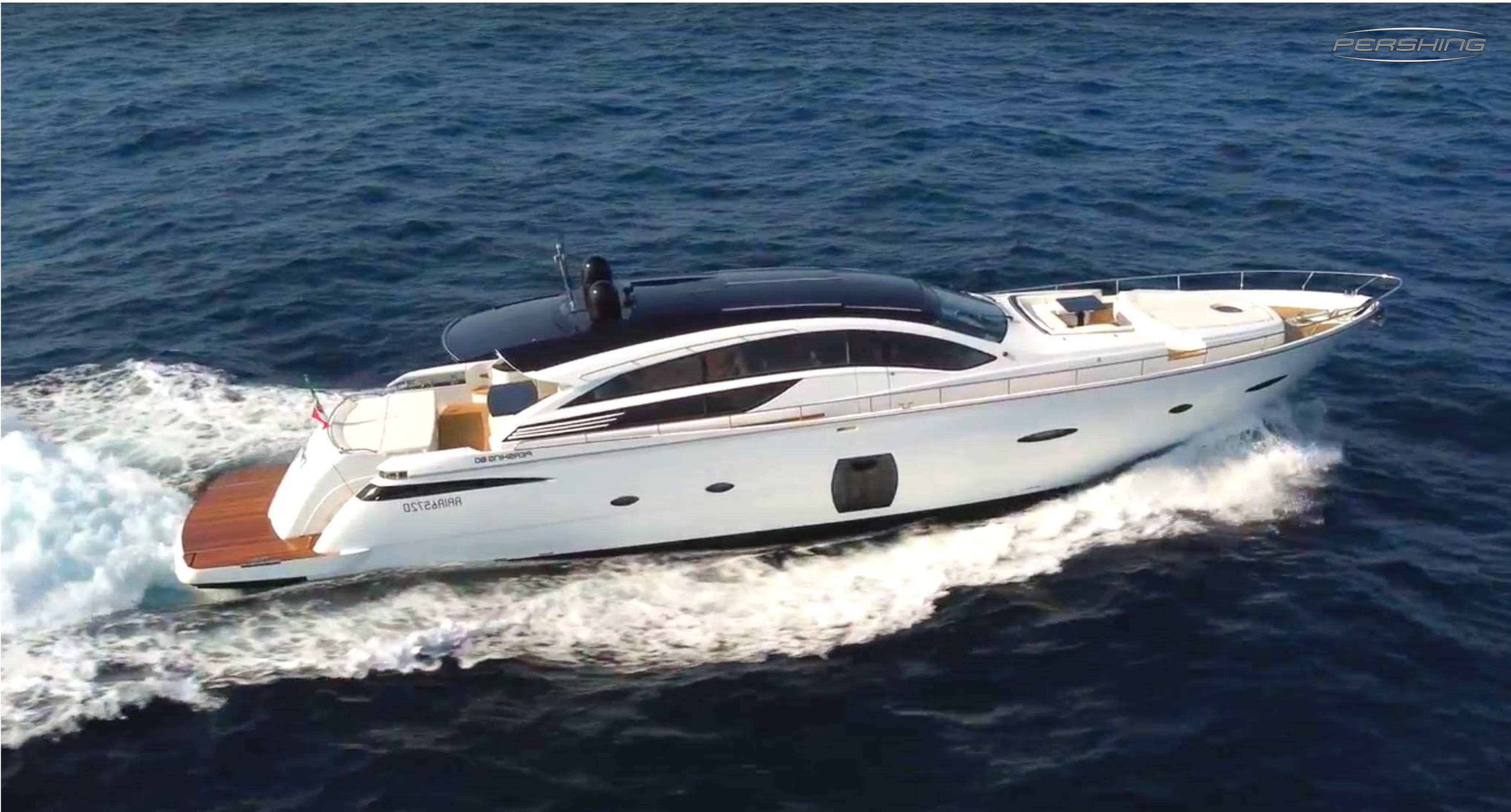
THYKE II PERSHING 80