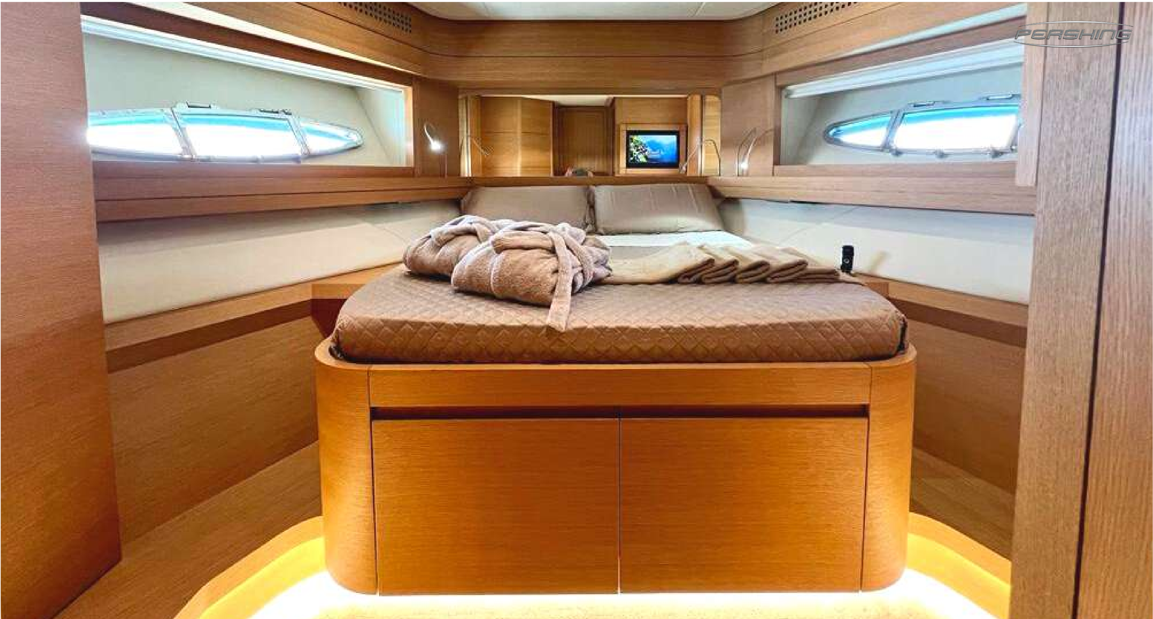
THYKE II PERSHING 80