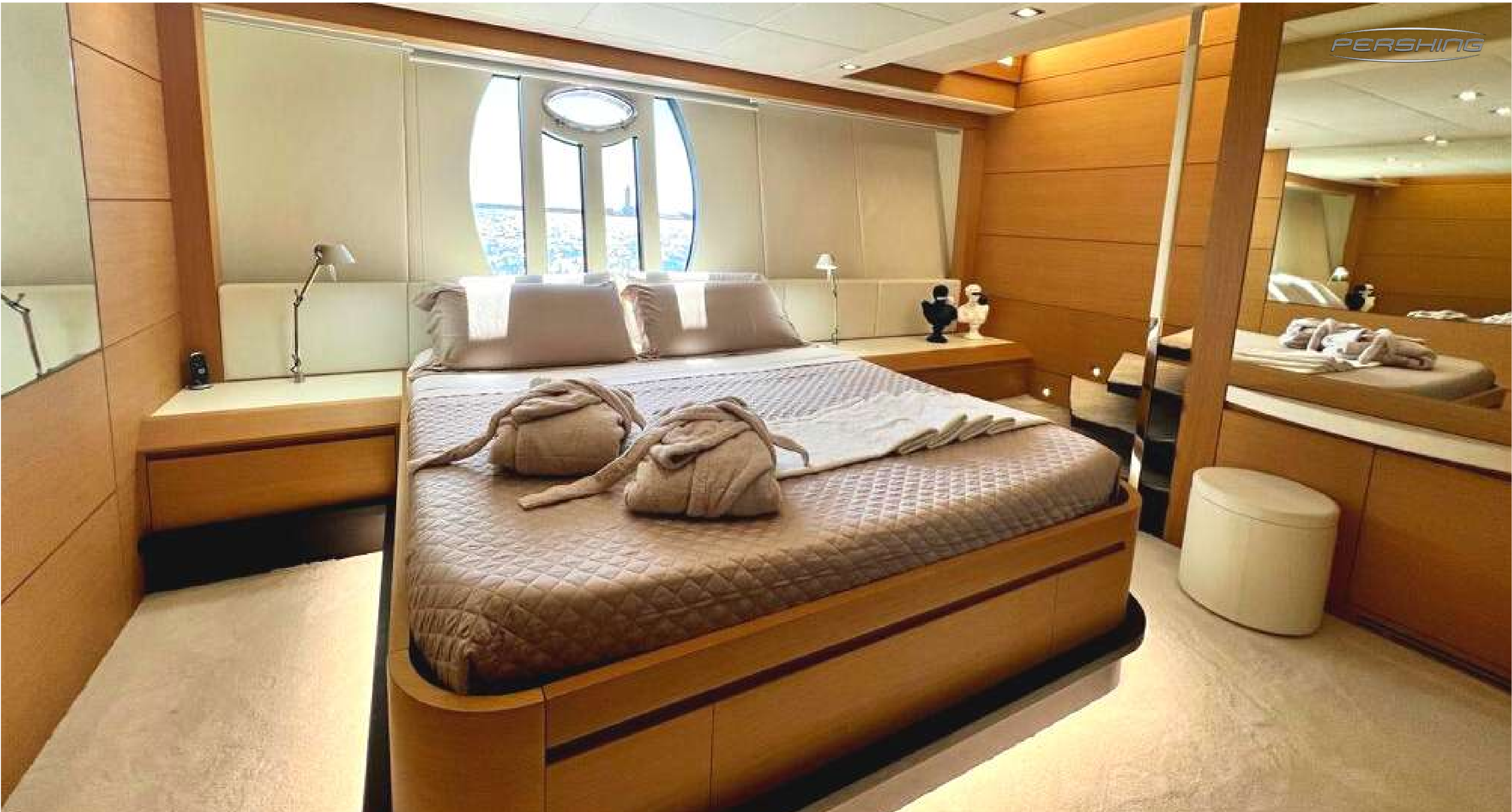
THYKE II PERSHING 80