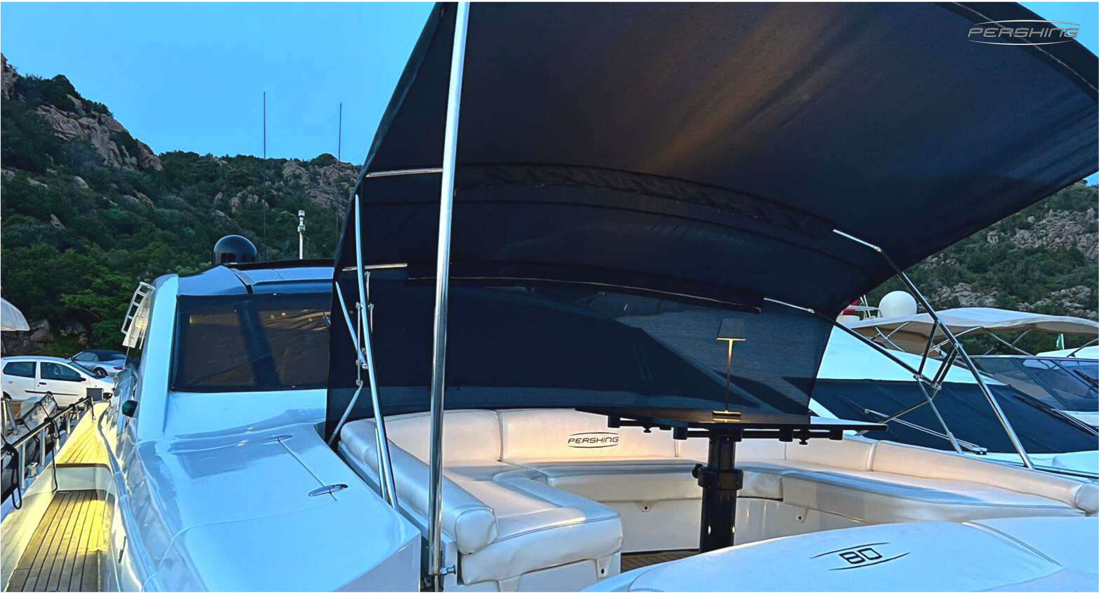
THYKE II PERSHING 80