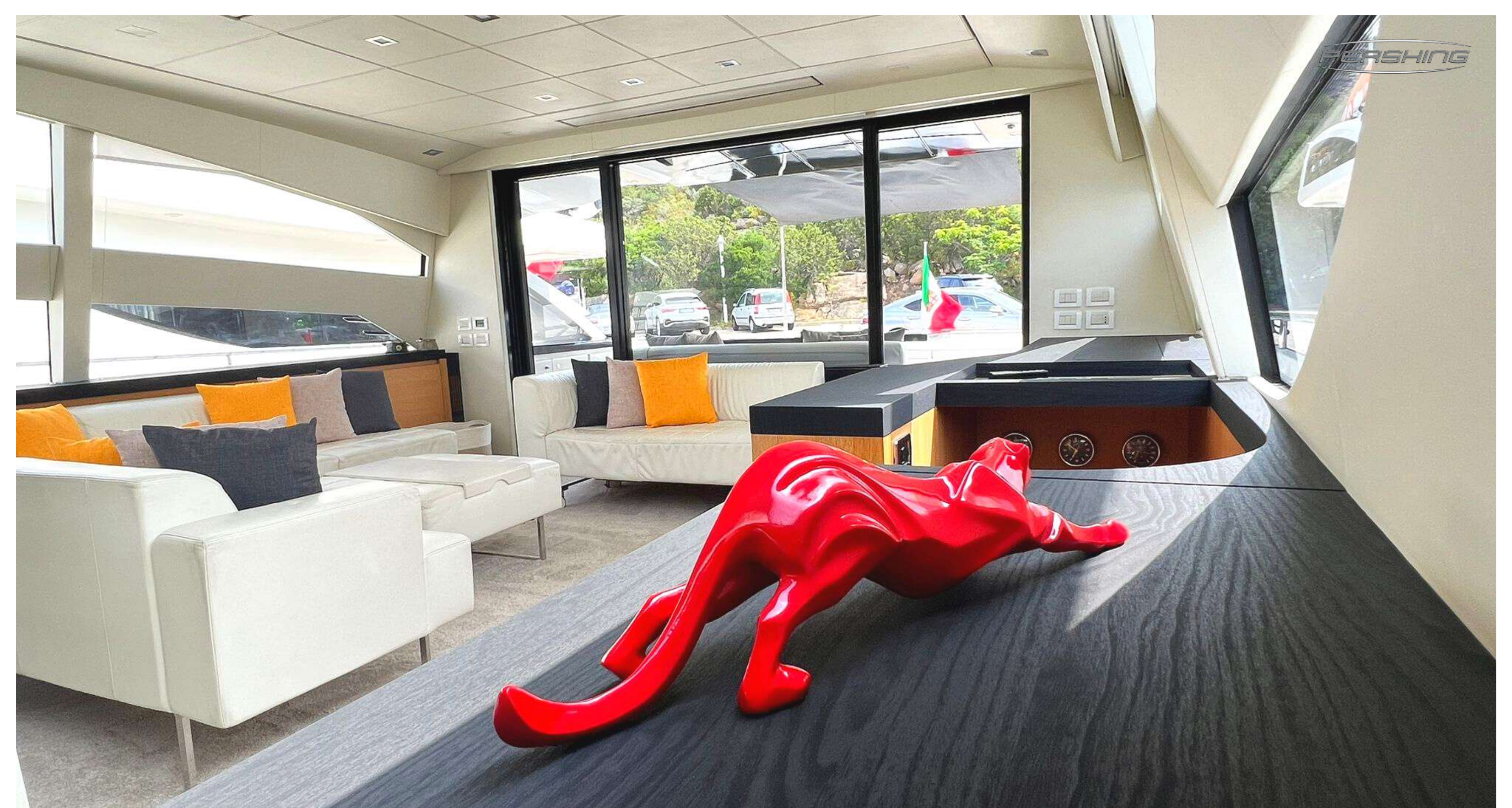
THYKE II PERSHING 80