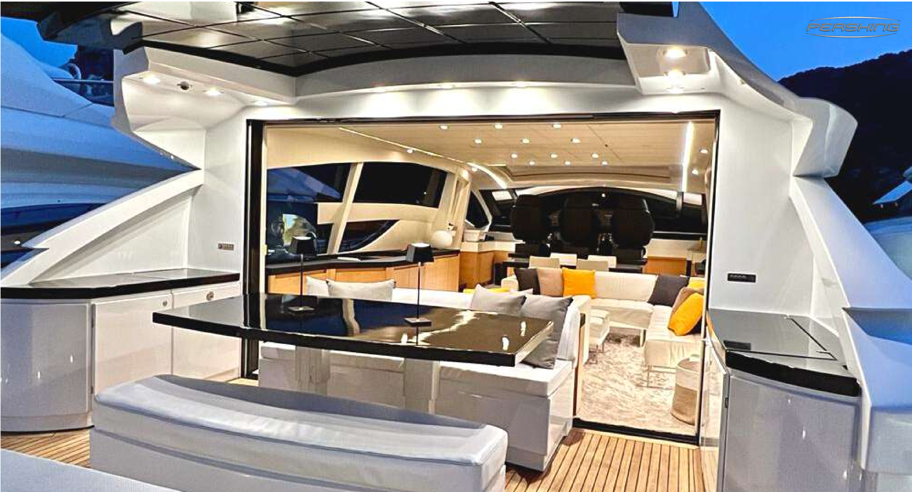
THYKE II PERSHING 80