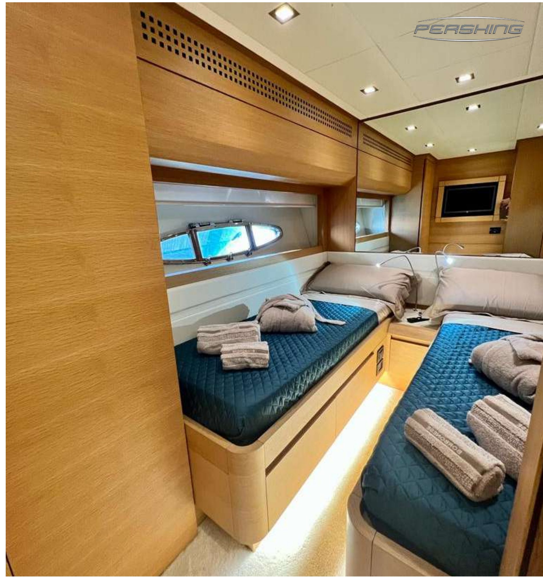
THYKE II PERSHING 80