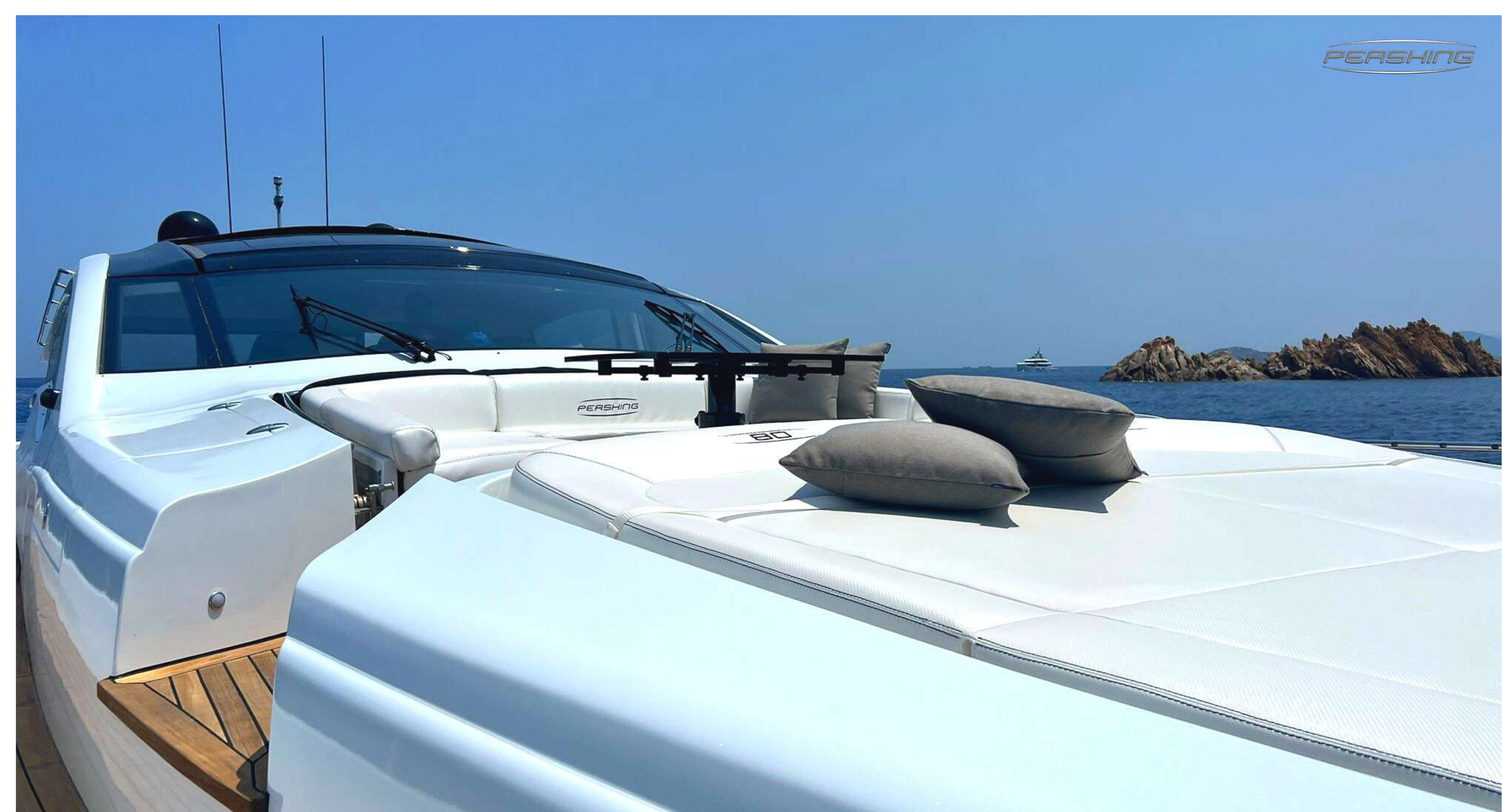
THYKE II PERSHING 80