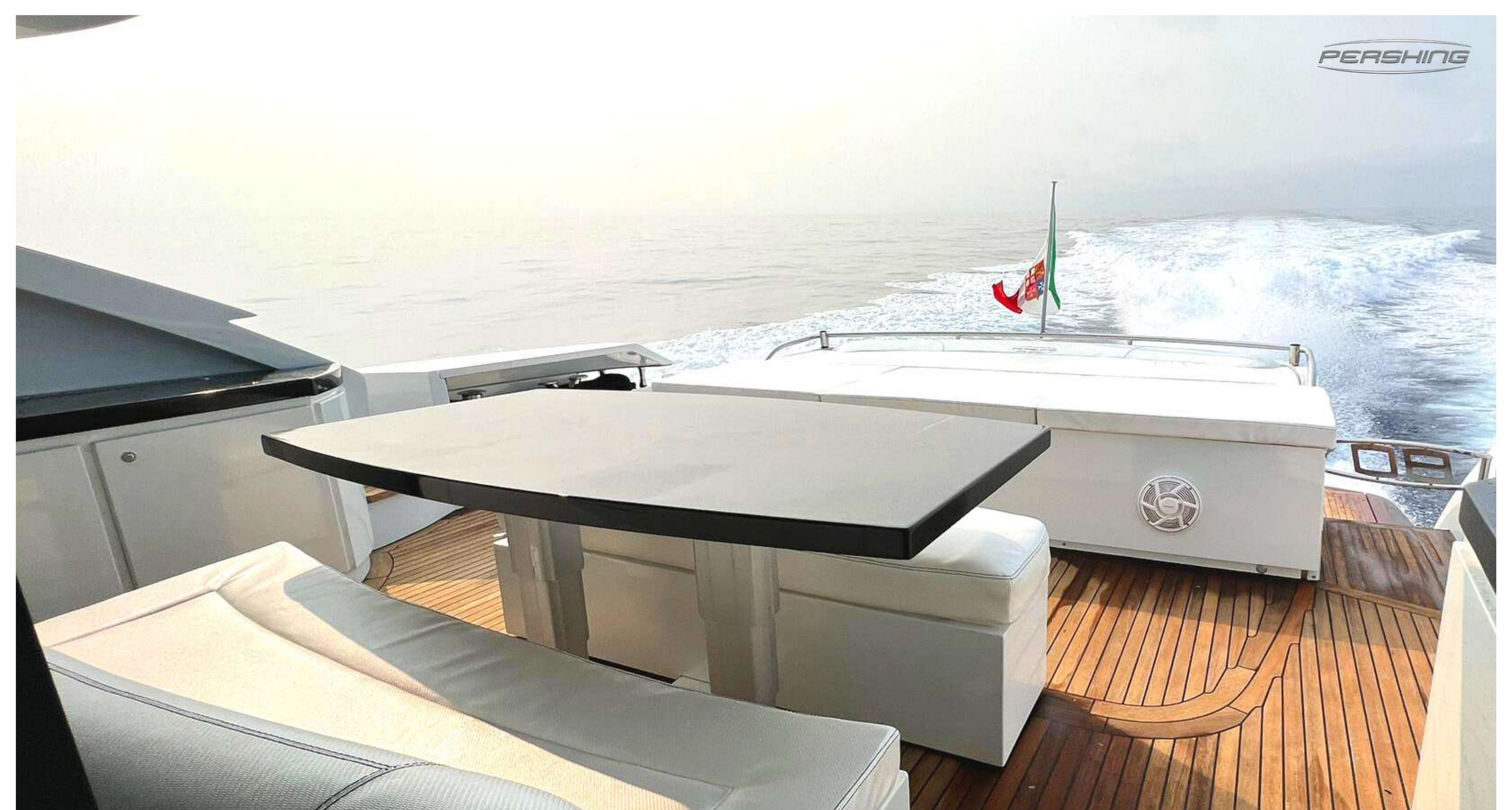
THYKE II PERSHING 80