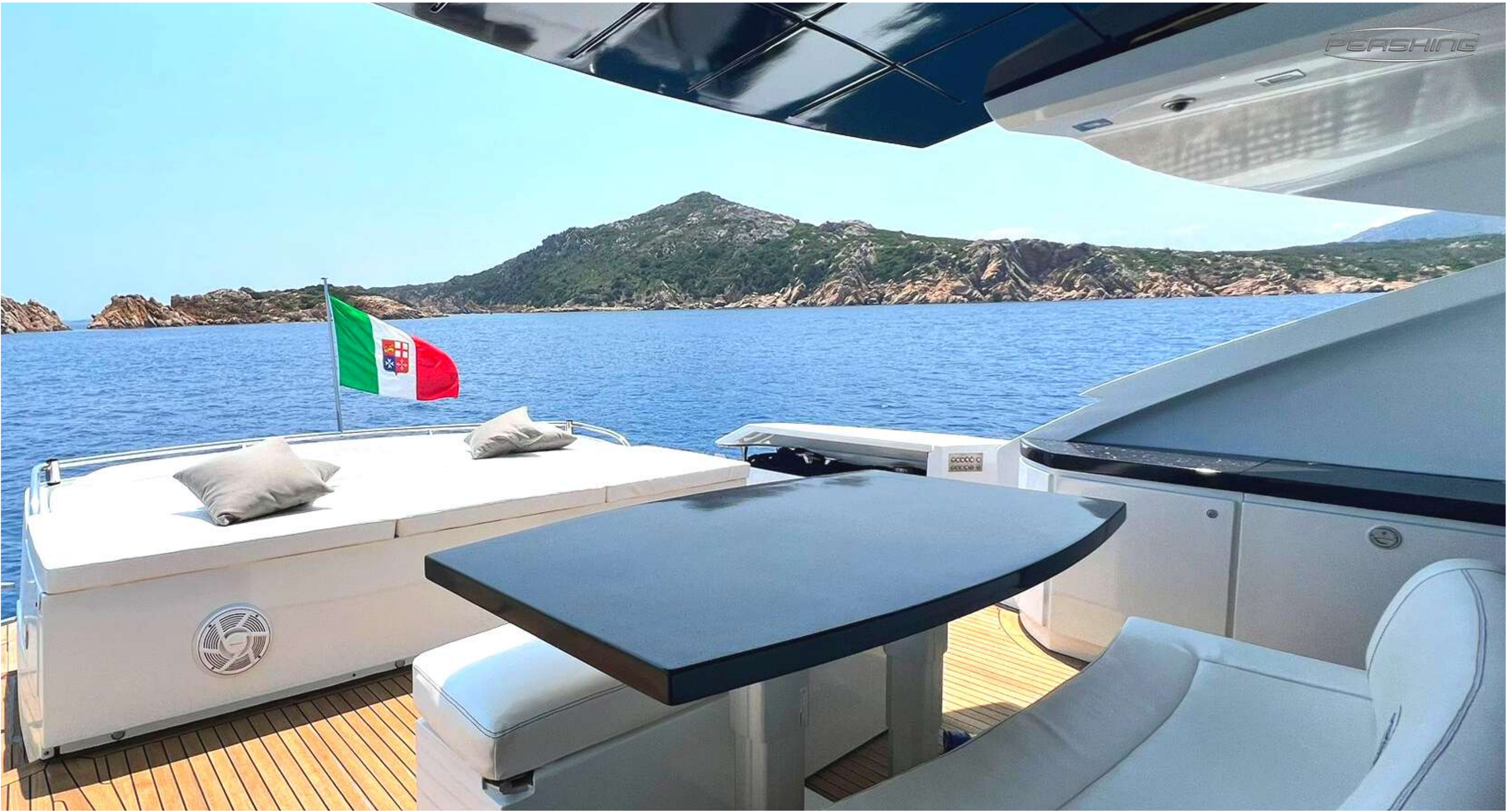
THYKE II PERSHING 80