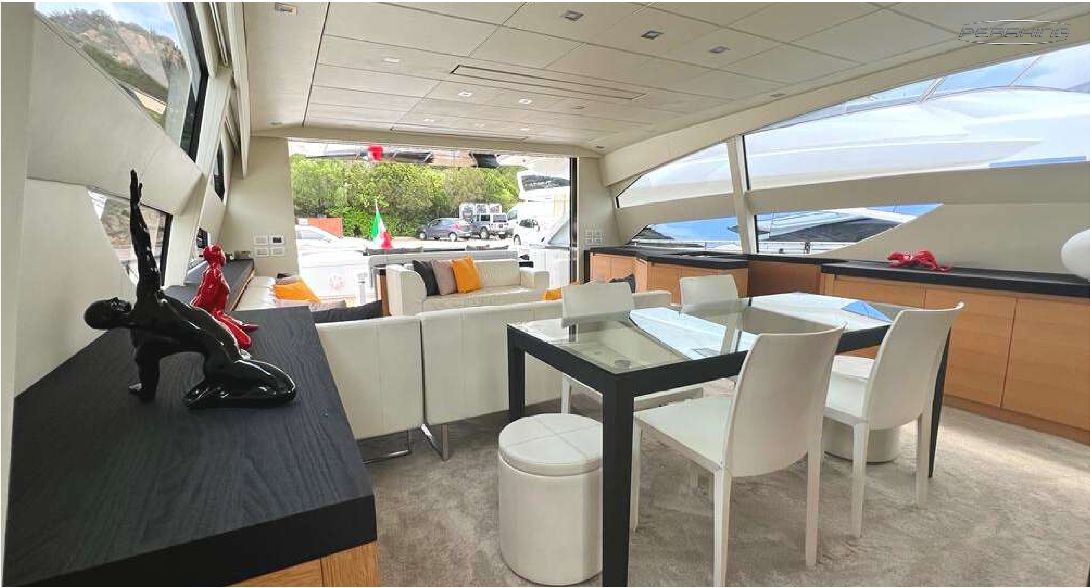
THYKE II PERSHING 80