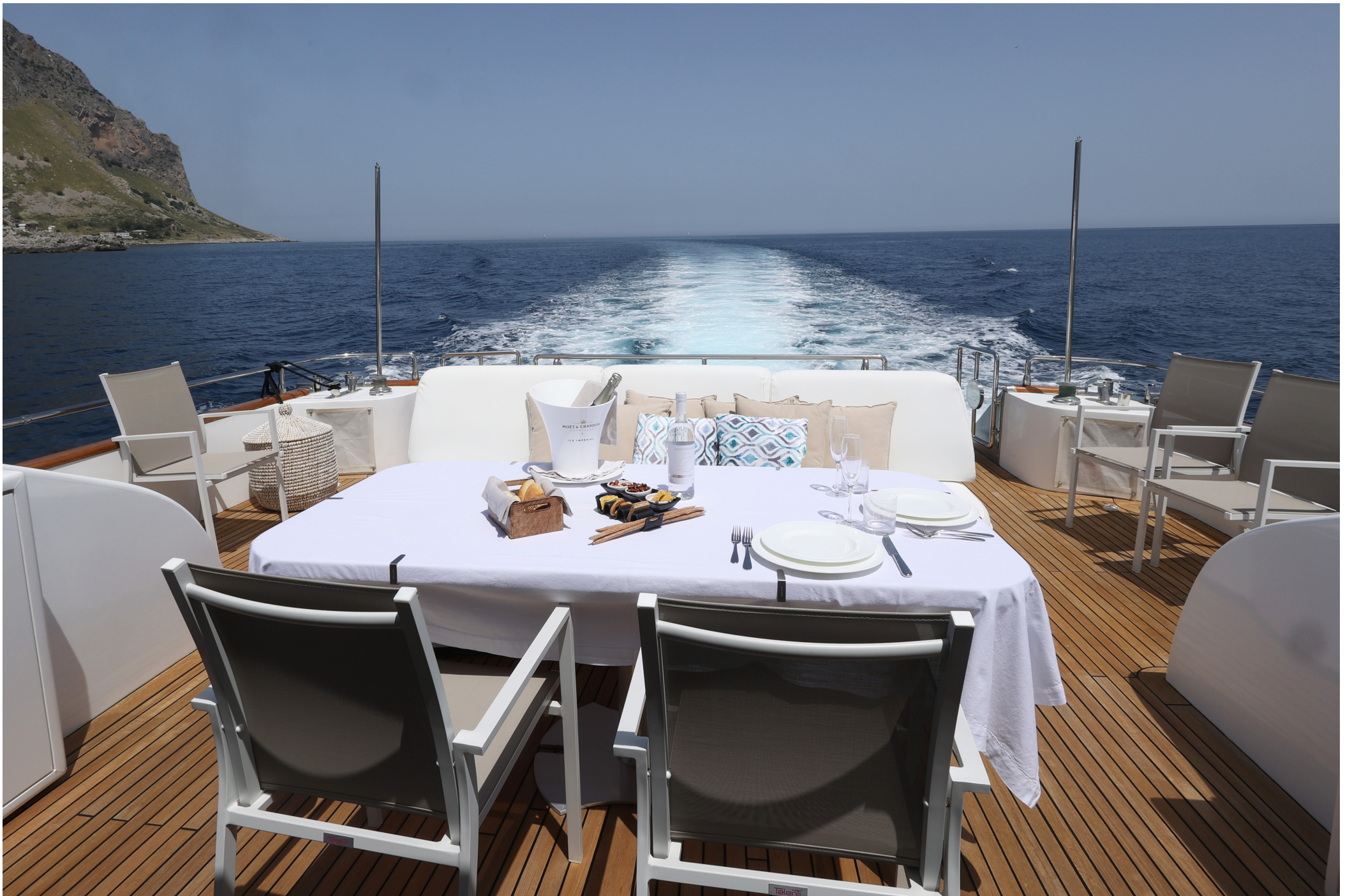
VELVET 90 "Eacos"