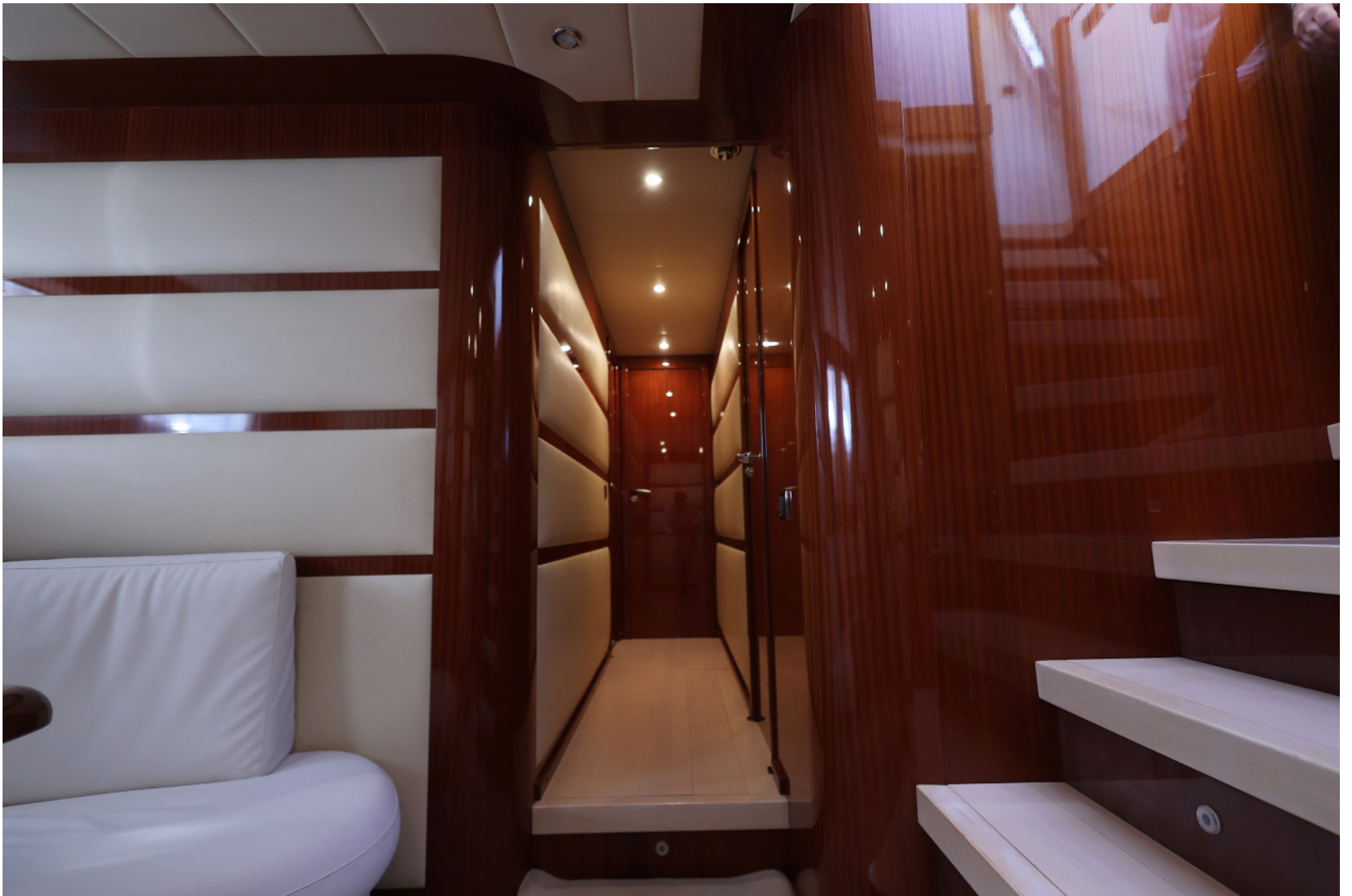
VELVET 90 "Eacos"