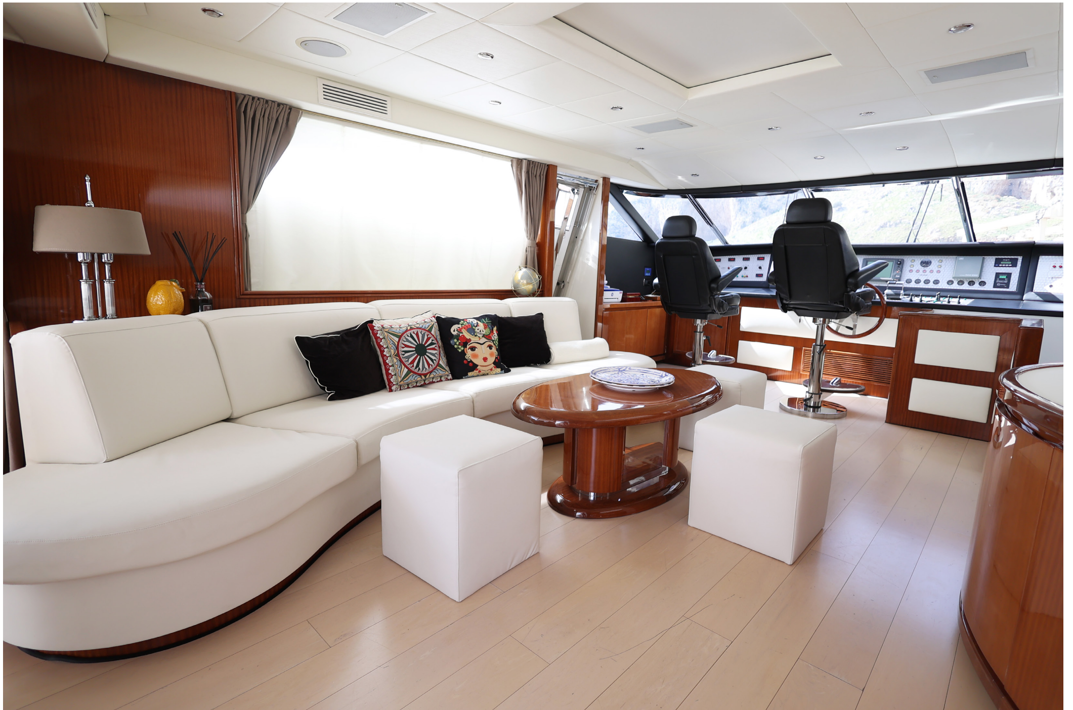
VELVET 90 "Eacos"