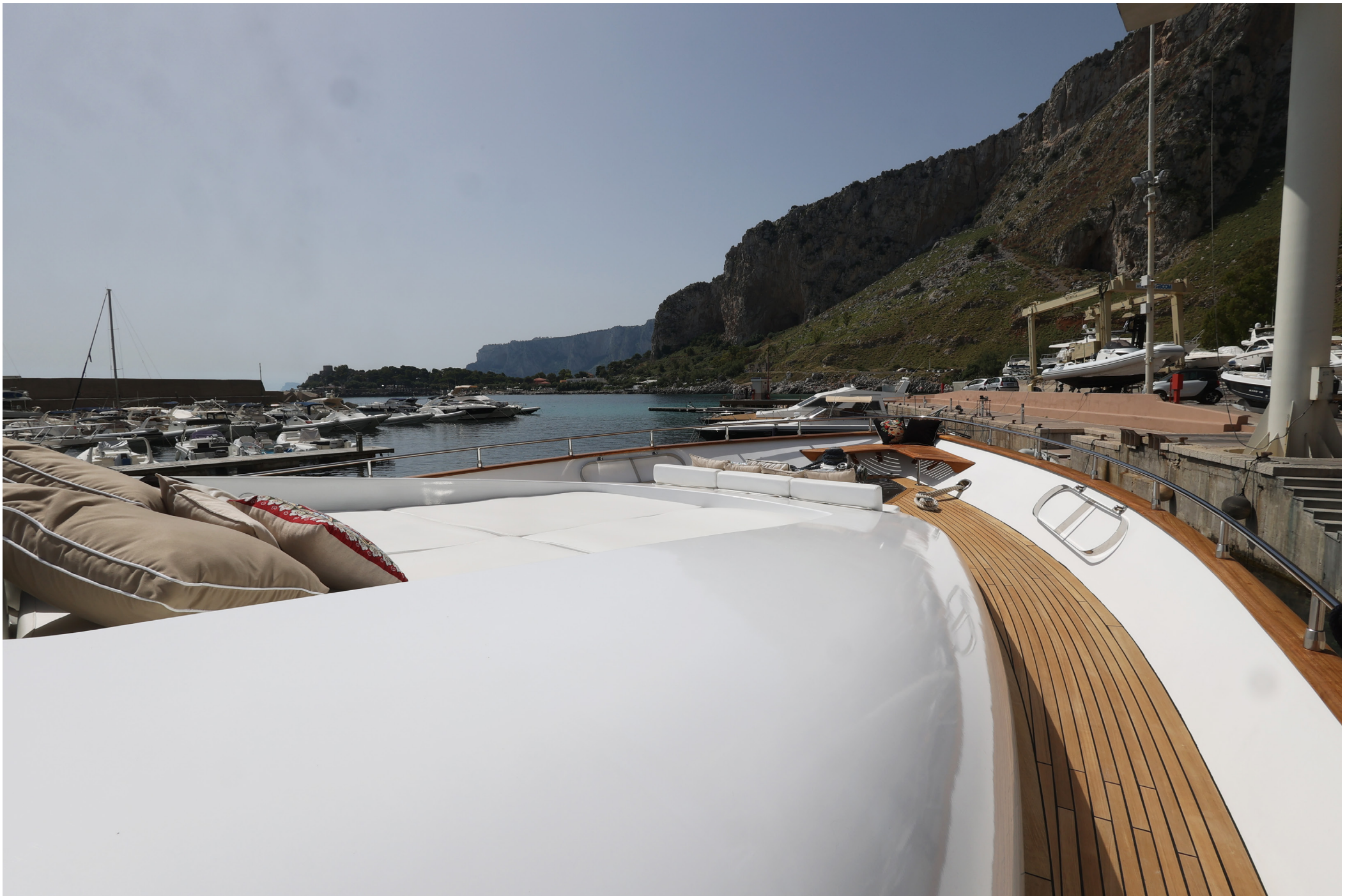
VELVET 90 “Eacos”