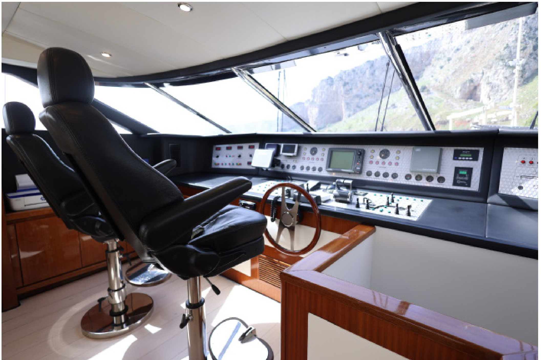
VELVET 90 "Eacos"