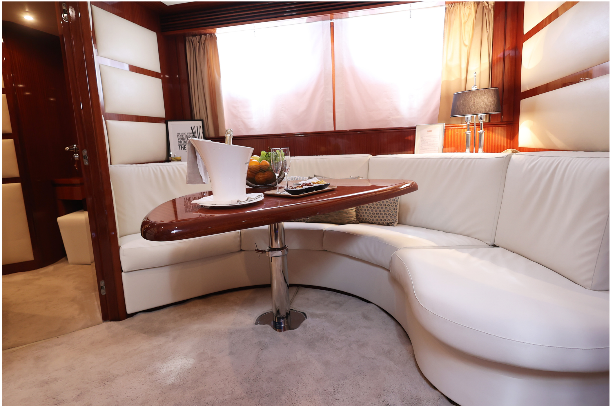
VELVET 90 "Eacos"