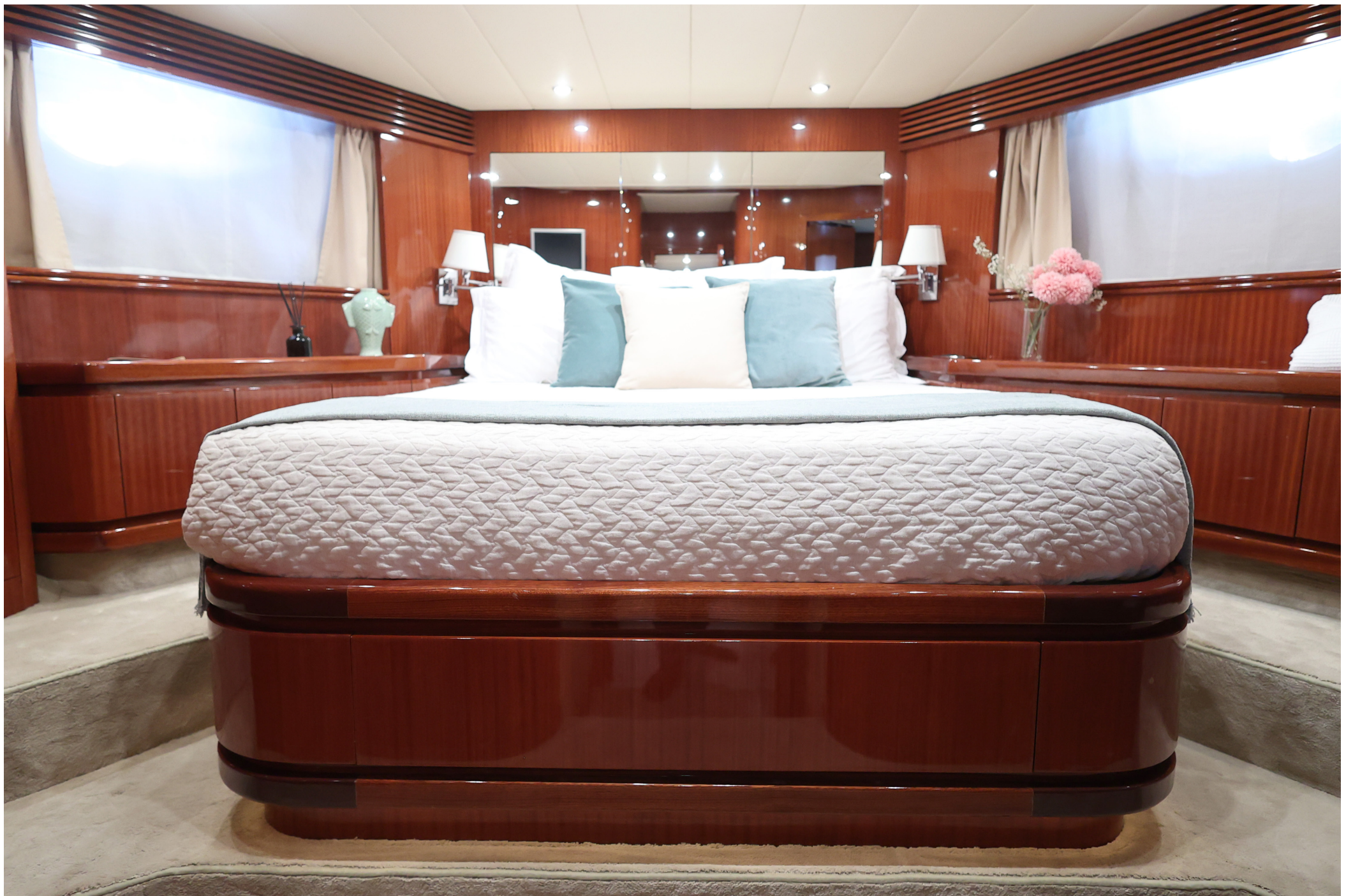
VELVET 90 "Eacos"