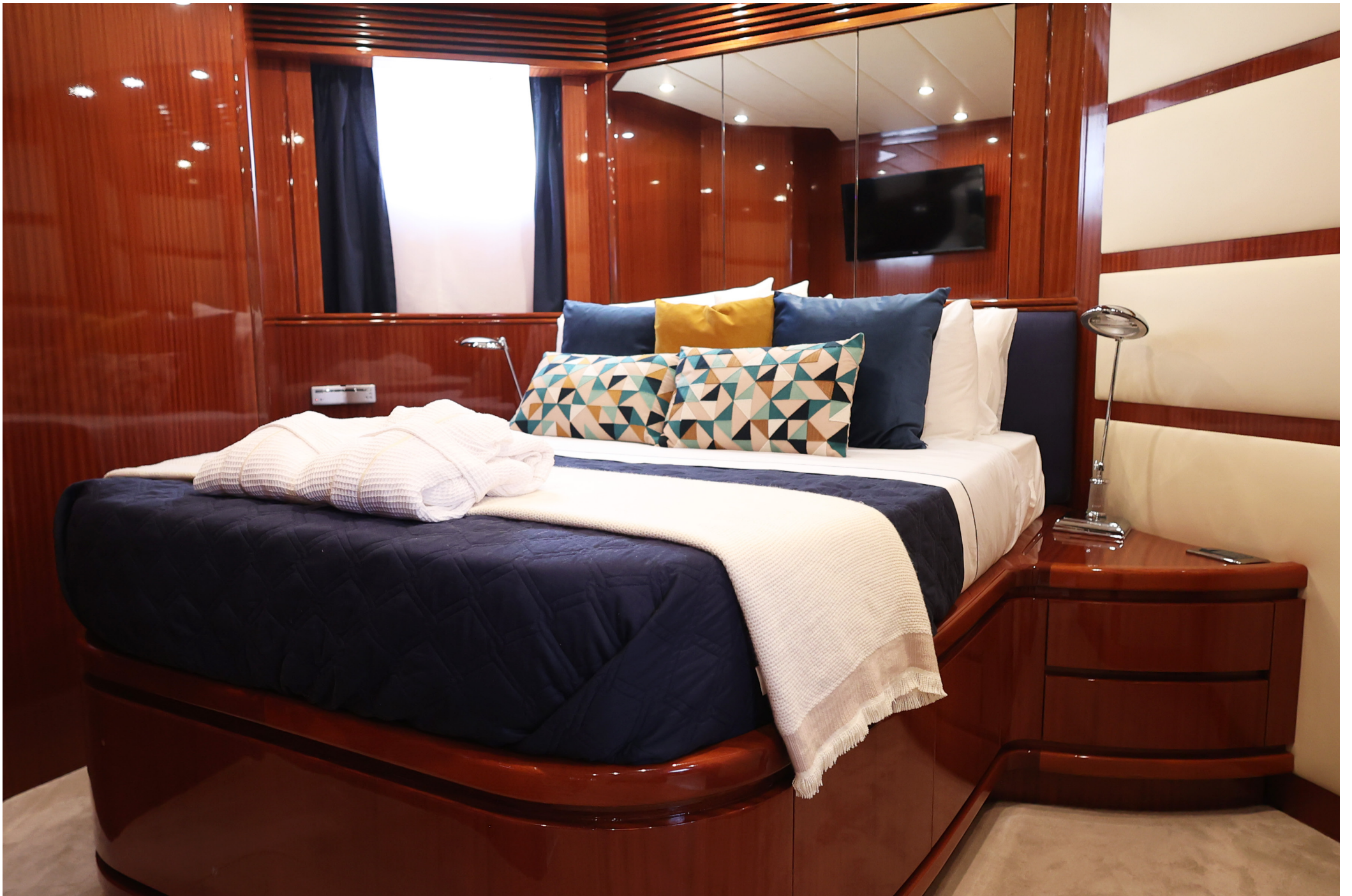
VELVET 90 "Eacos"