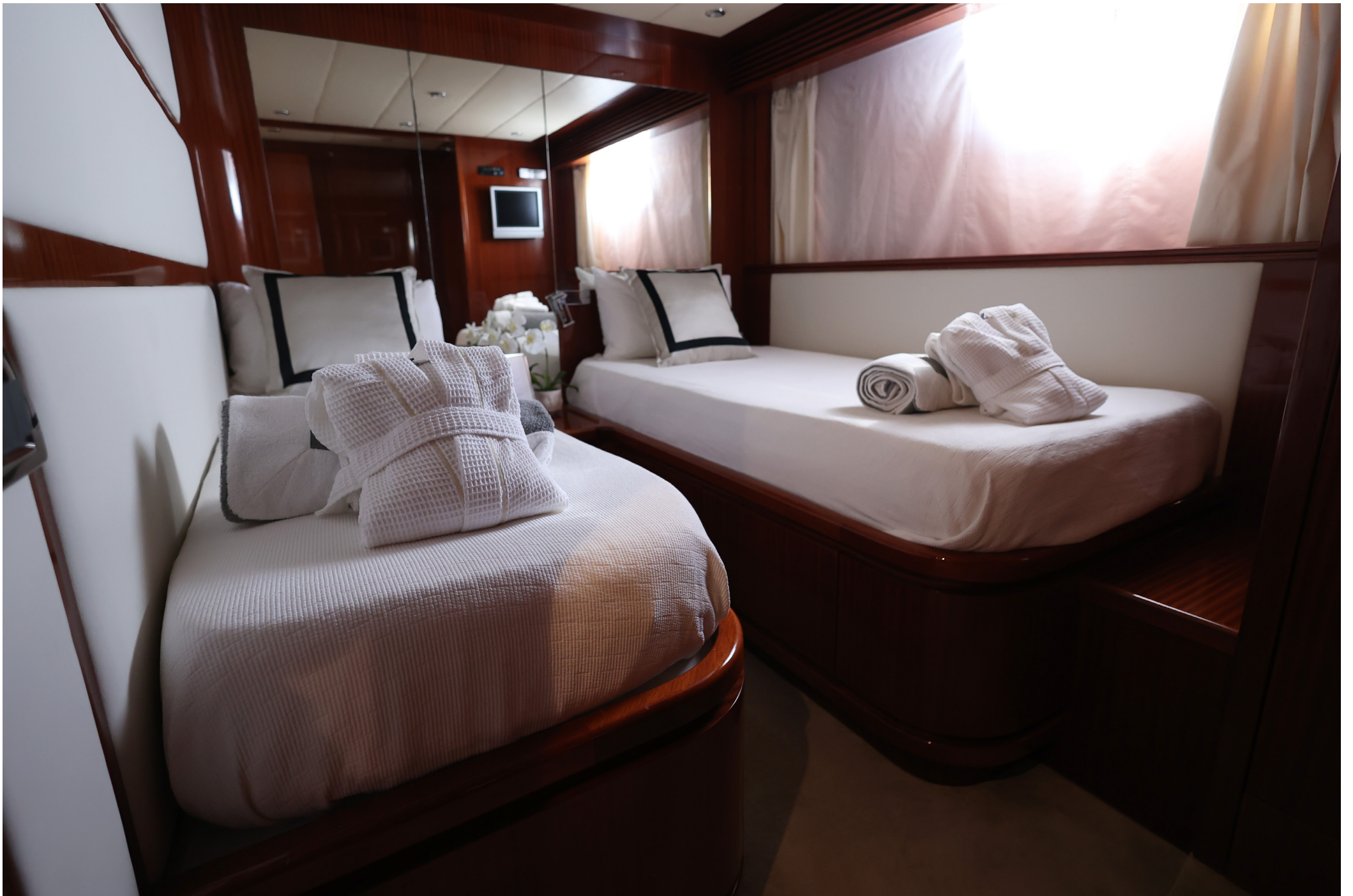
VELVET 90 "Eacos"