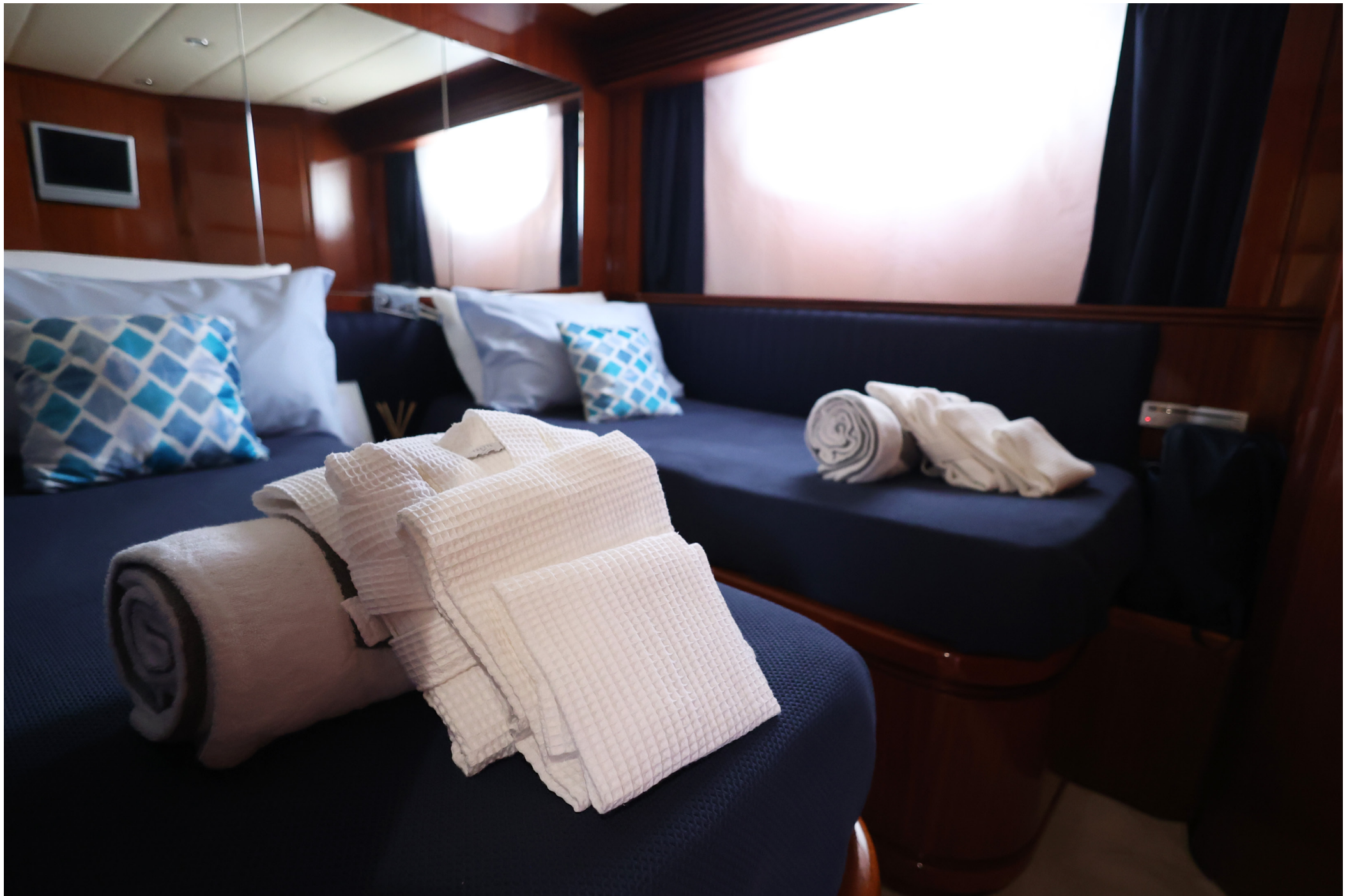
VELVET 90 "Eacos"