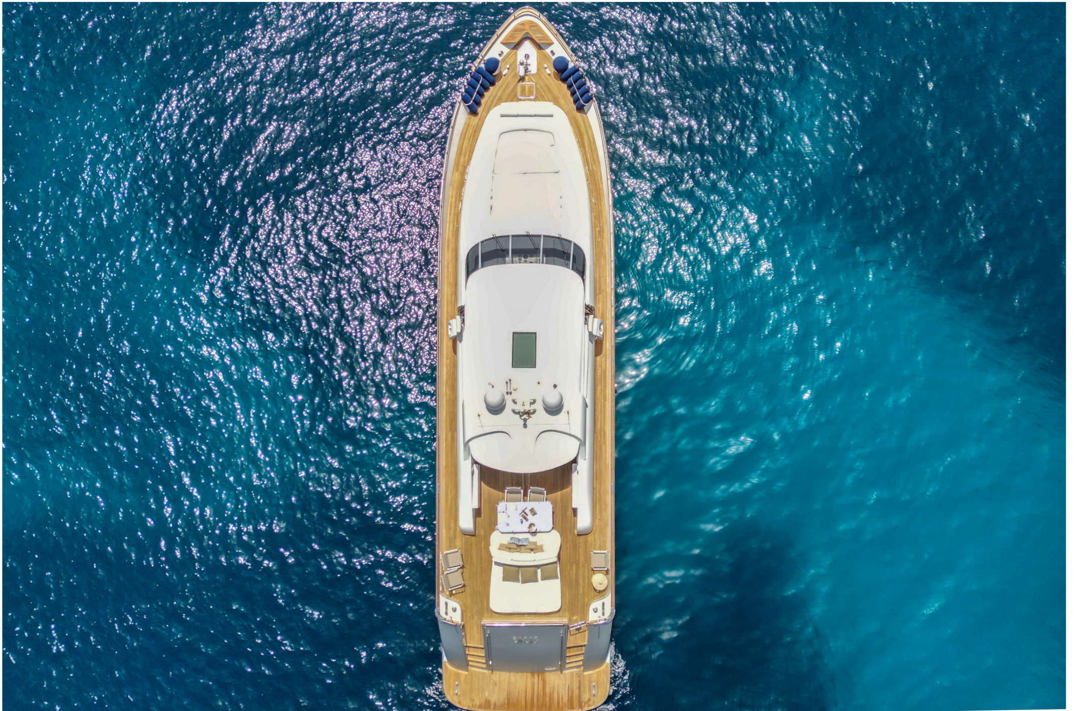
VELVET 90 "Eacos"