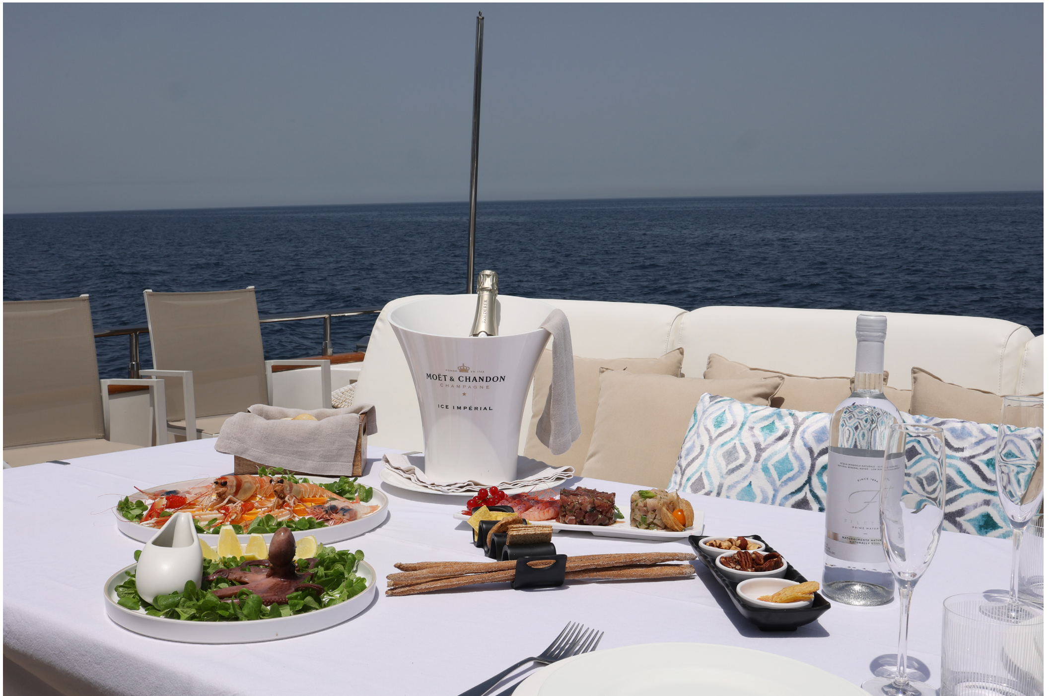
VELVET 90 “Eacos”