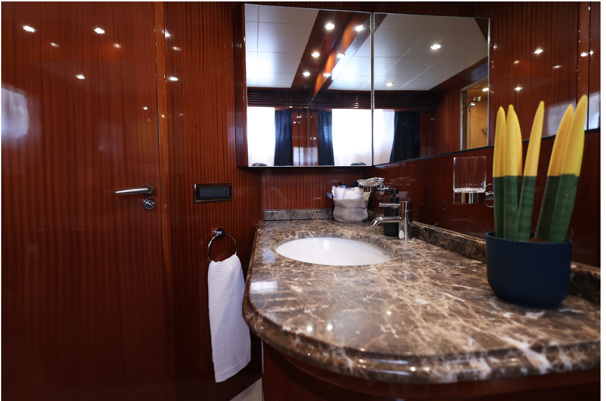
VELVET 90 "Eacos"