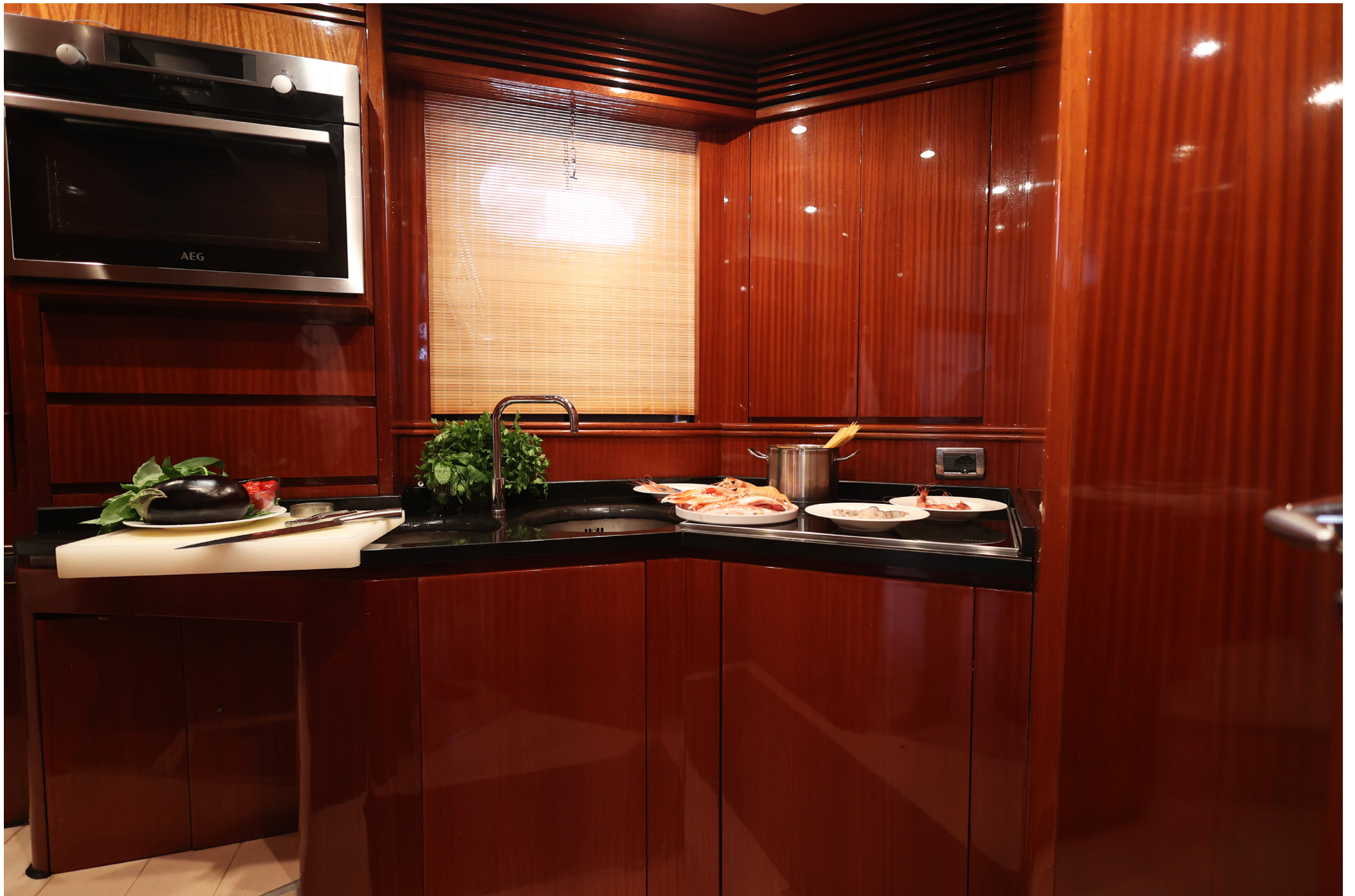
VELVET 90 "Eacos"