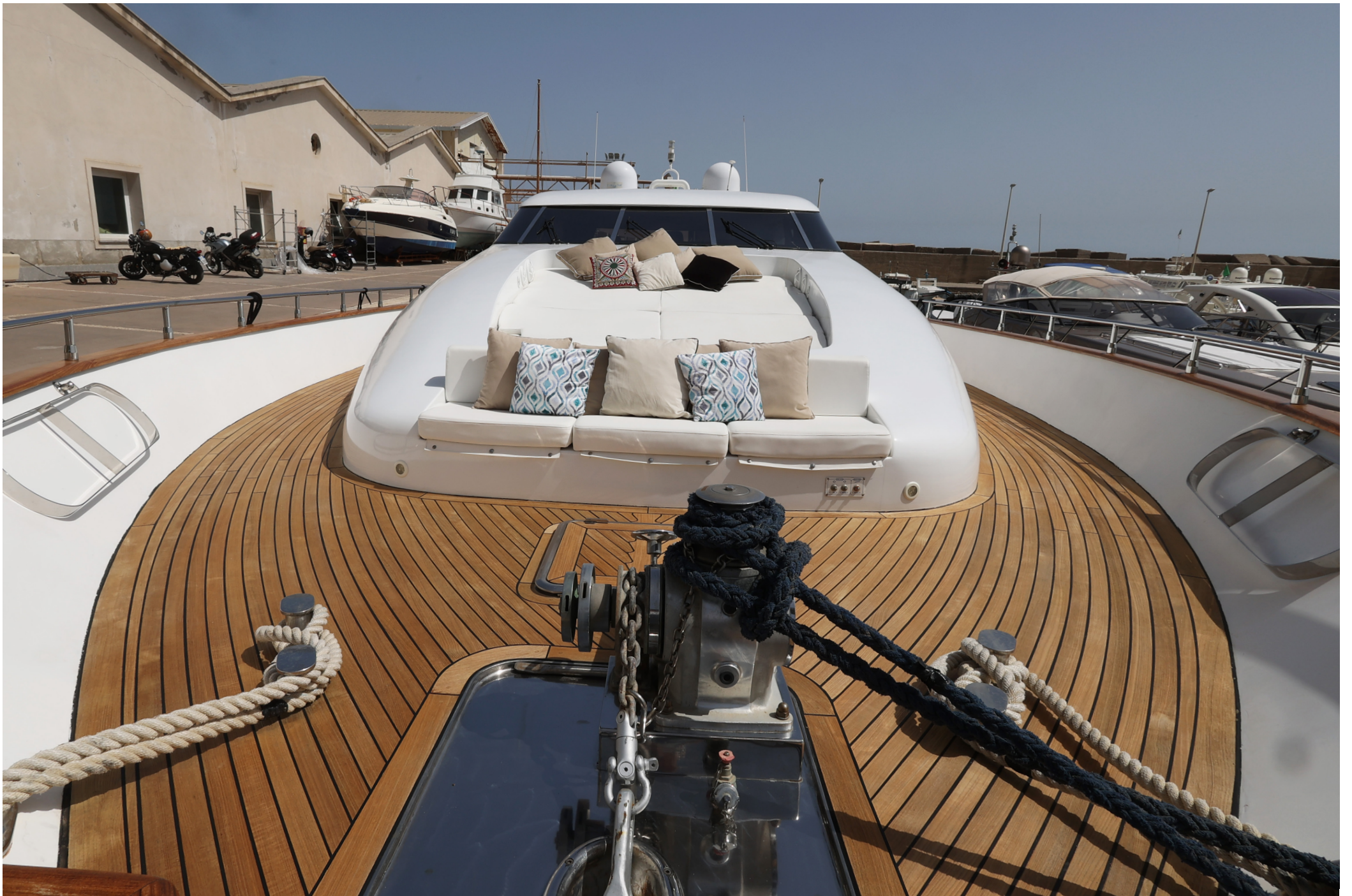
VELVET 90 “Eacos”