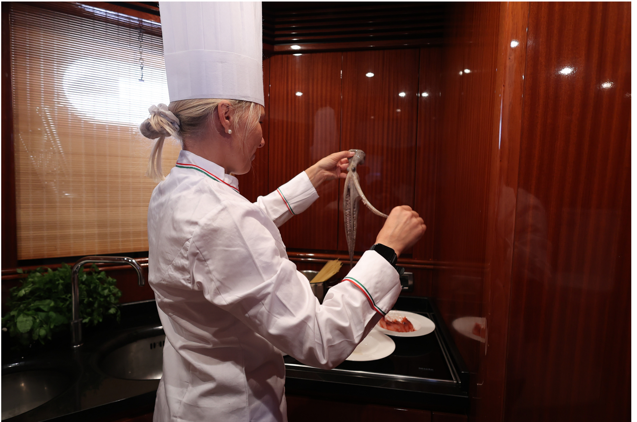
VELVET 90 "Eacos"