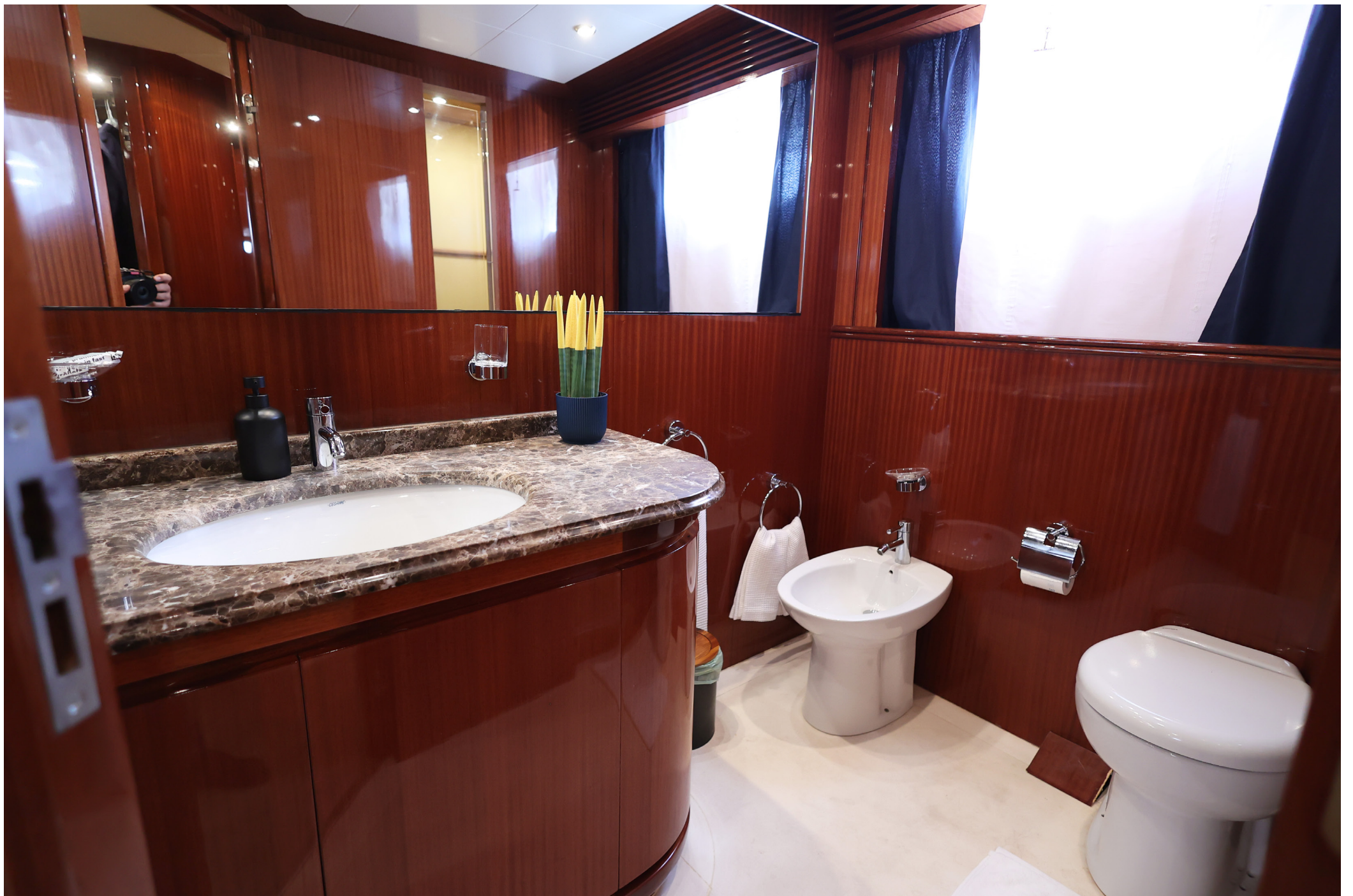
VELVET 90 "Eacos"