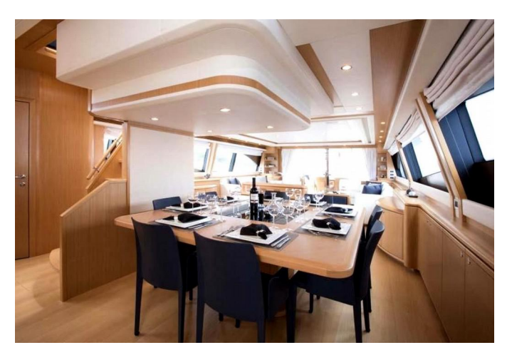
With her bright, contemporary and elegant feel she offers unrivalled style and comfort. The light and airy saloon generously spacious with the two facing divans, the beautiful and well separate dining area with his large square table, the soft colour of the furniture and of the wooden floor, make this living area truly impressive.