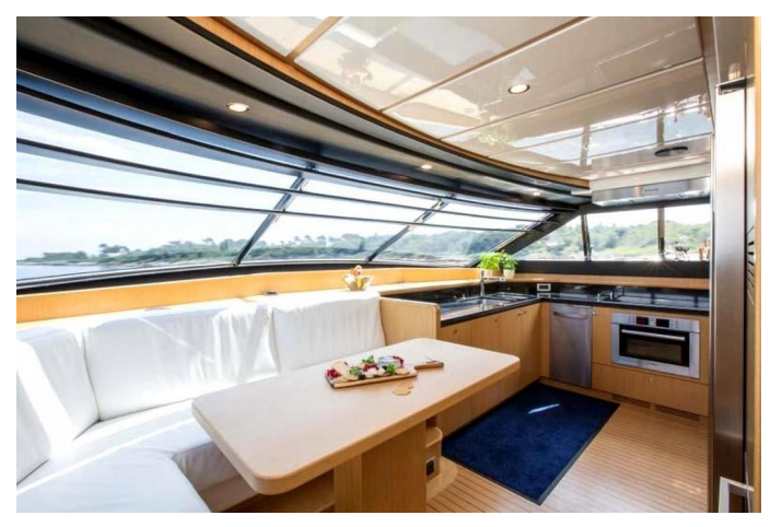
The stern divan and table extend outside the warm and cosy atmosphere of the Boat. The original galley faces the bow through the front windscreen, and the separate pilot house stand on the galley.