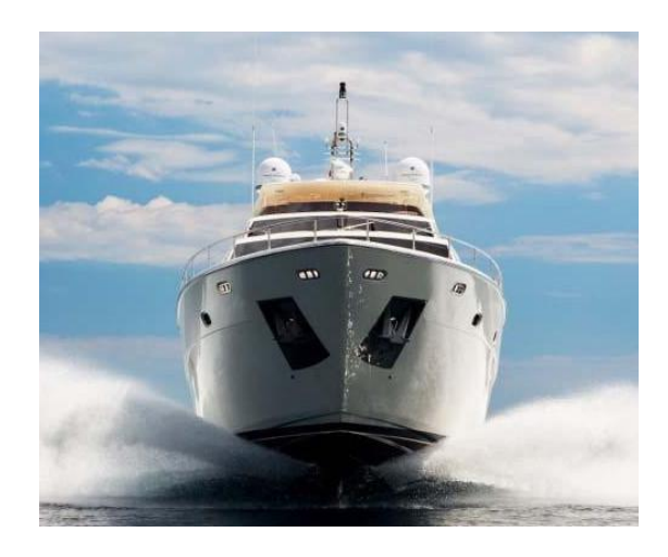
M/Y PORTHOS SANS ABRI, a beautiful FERRETTI 881 RPH, offers dimensions and spaces quite similar to the yachts of 100" and over.