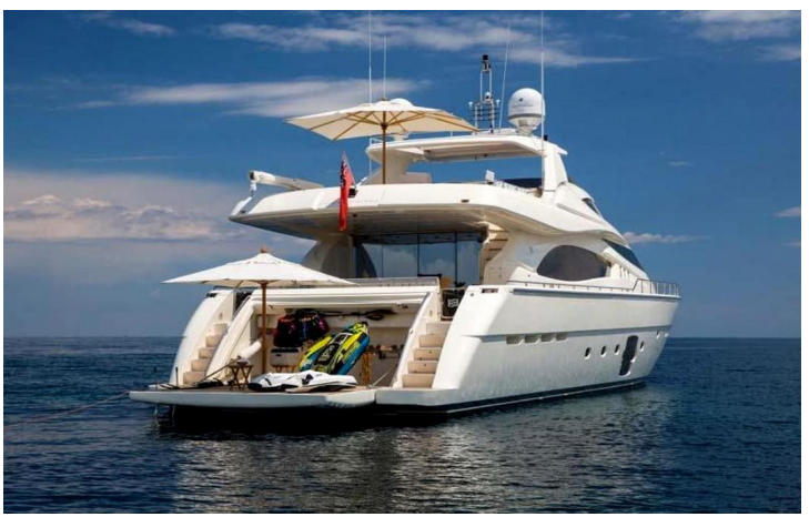
The yacht is fully equipped at the top level, and among the numerous toys there are also a spectacular slipway from the fly bridge and sea bob.