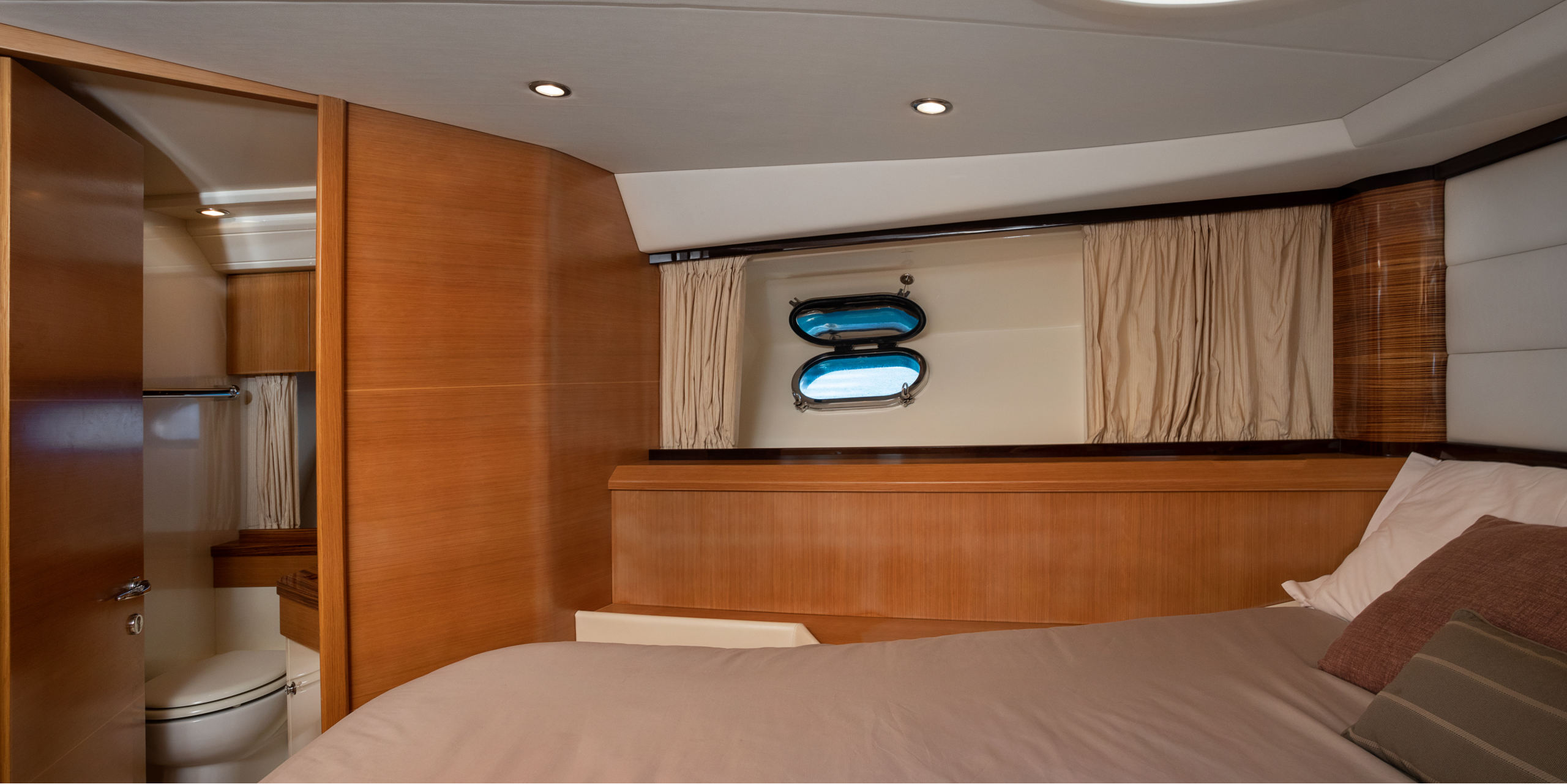
GAP | SARNICO 60