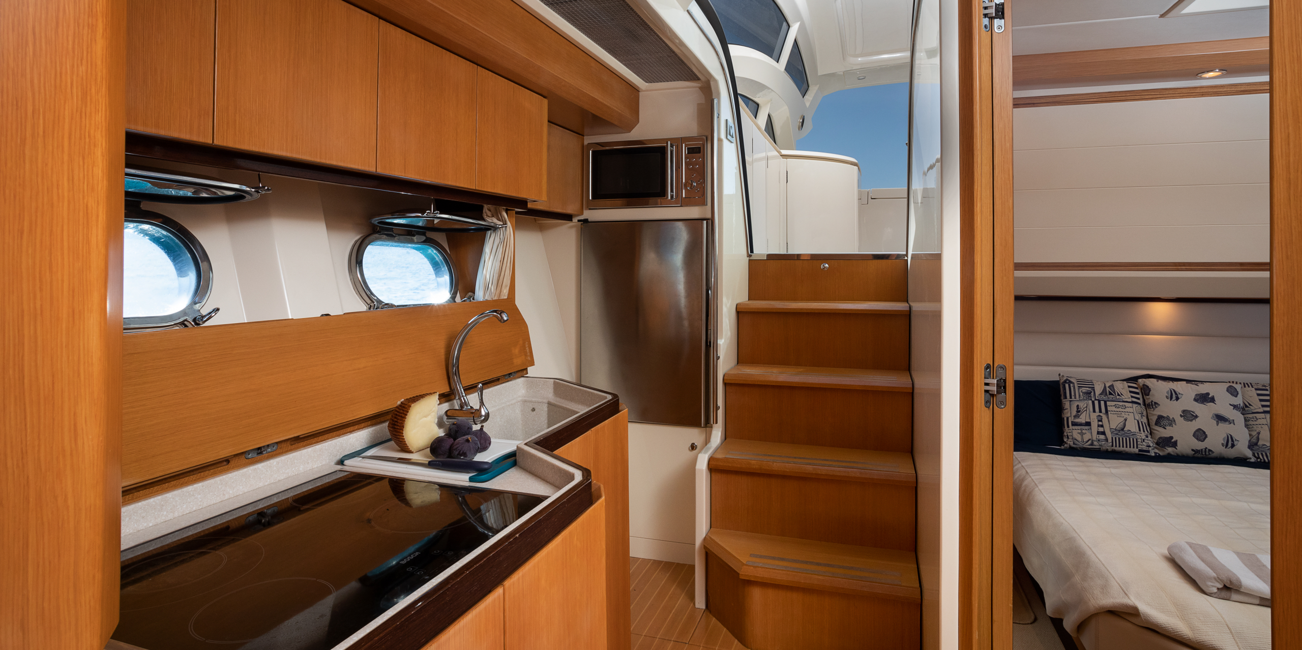
GAP | SARNICO 60