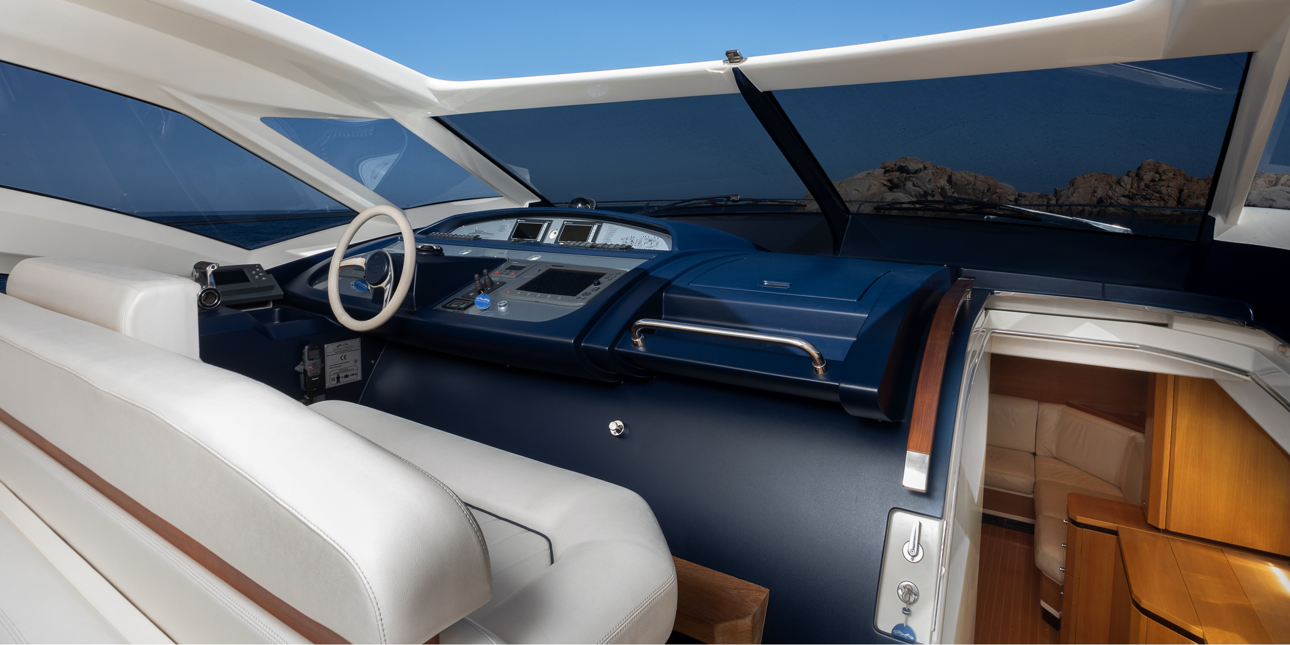
GAP | SARNICO 60