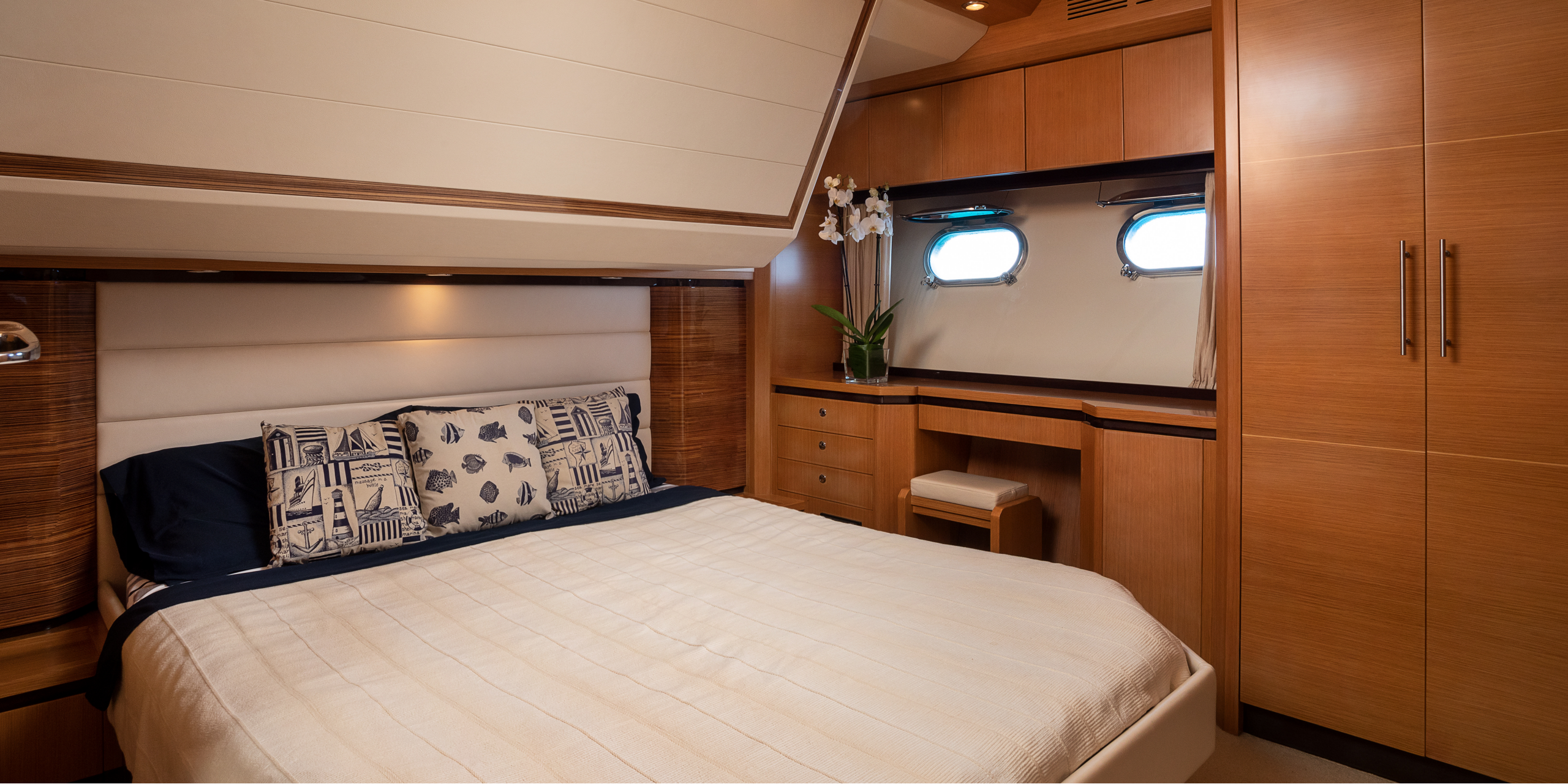
GAP | SARNICO 60