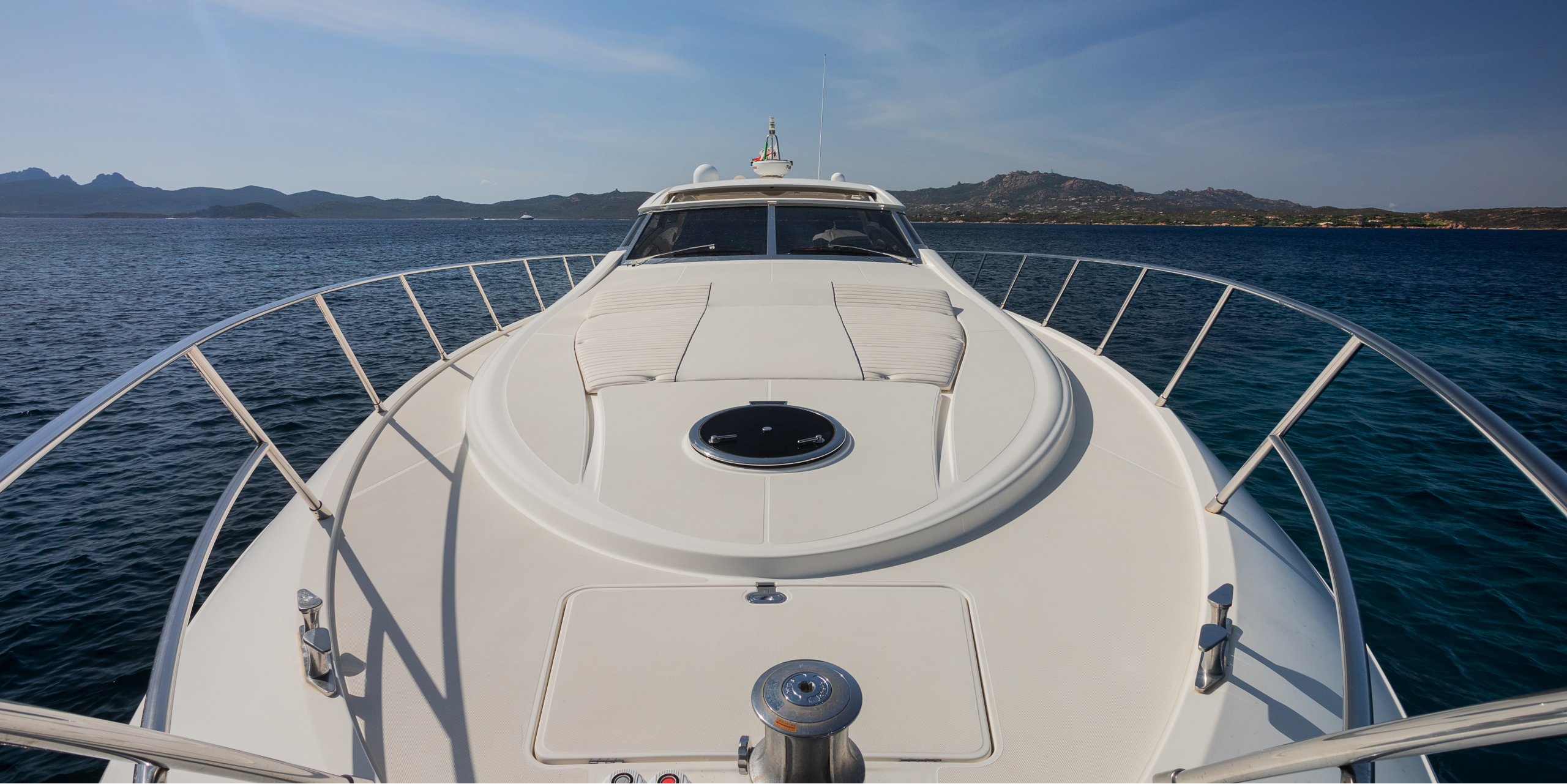
GAP | SARNICO 60