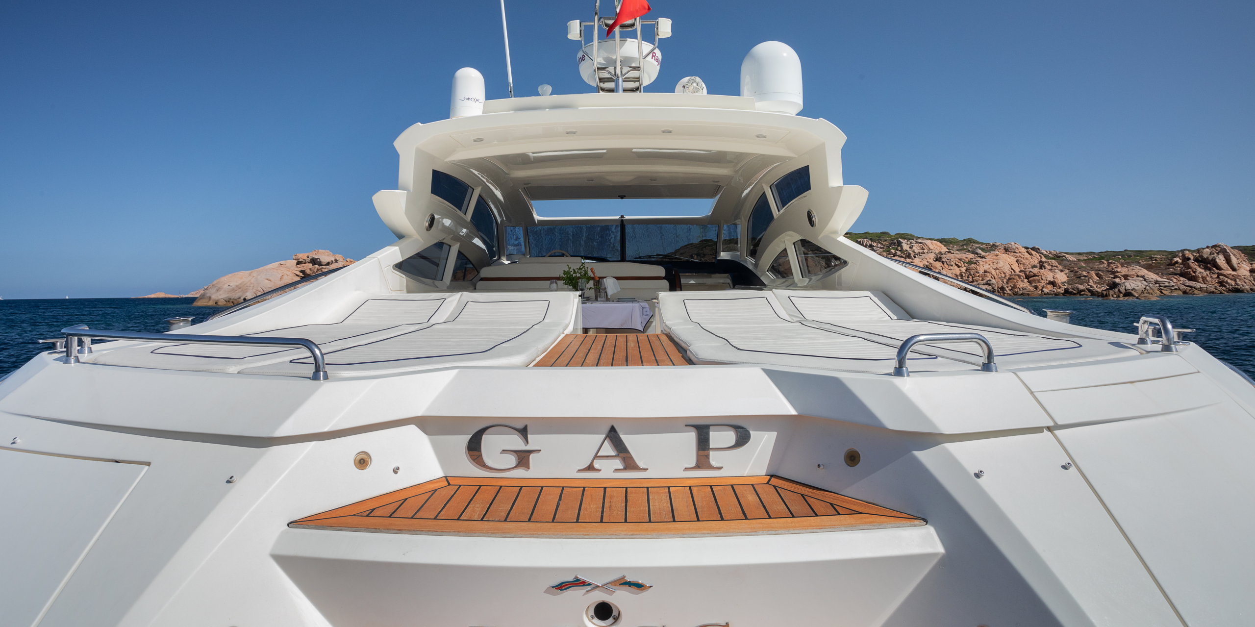
GAP | SARNICO 60