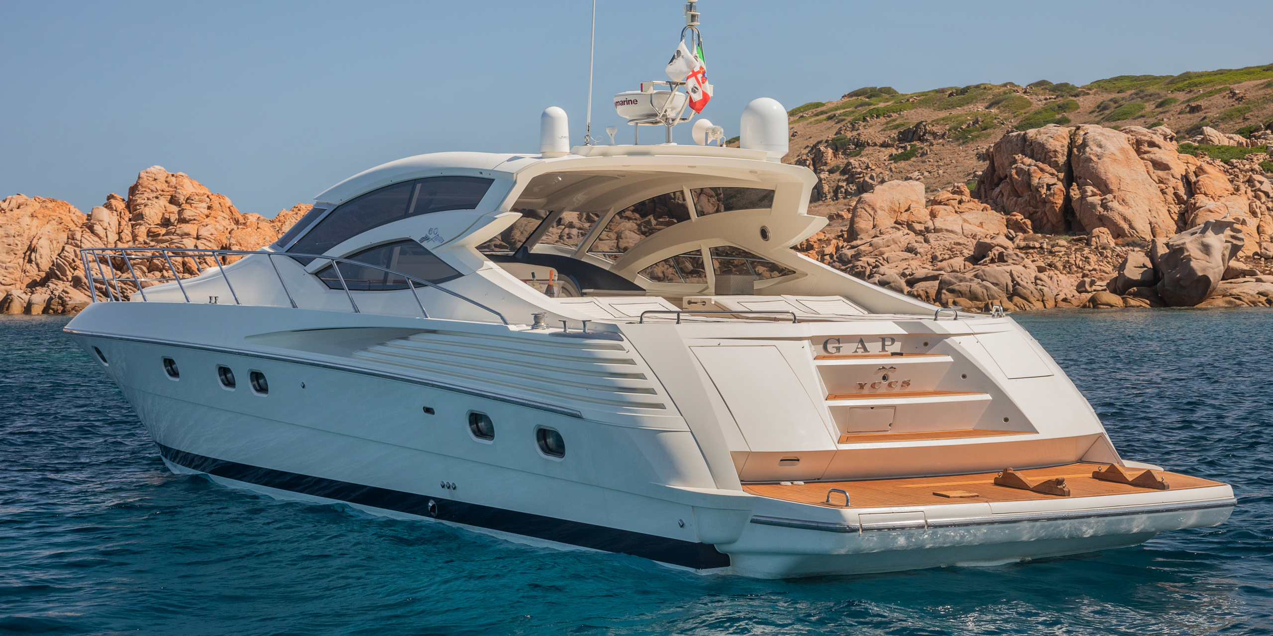
GAP | SARNICO 60